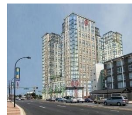
Site plan review for the Wheaton Safeway project was completed in less than six months.