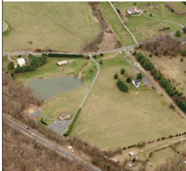
Existing development in the Rural Zone