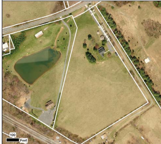
Rural Zone Typical Buildout Plan Pattern and Form