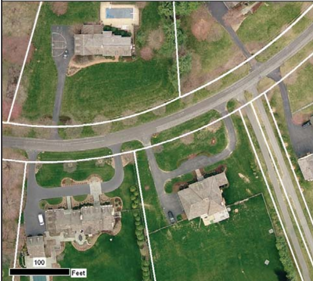
RE-2 Typical Build-Out Plan Pattern and Form