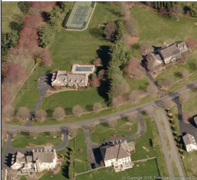
Existing development in the RE-2 zone