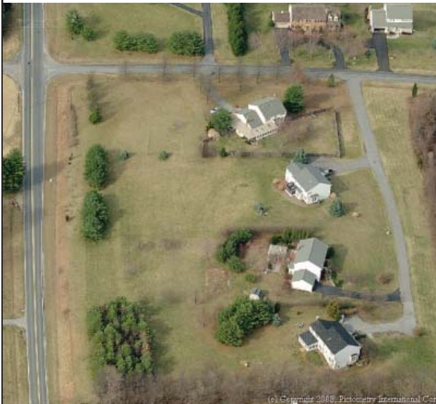
Existing development in the RE-1 Zone