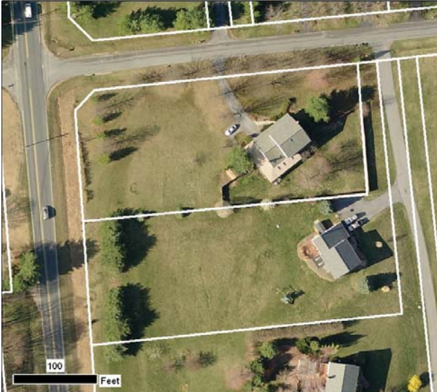
RE-1 Typical Buildout Plan Pattern and Form