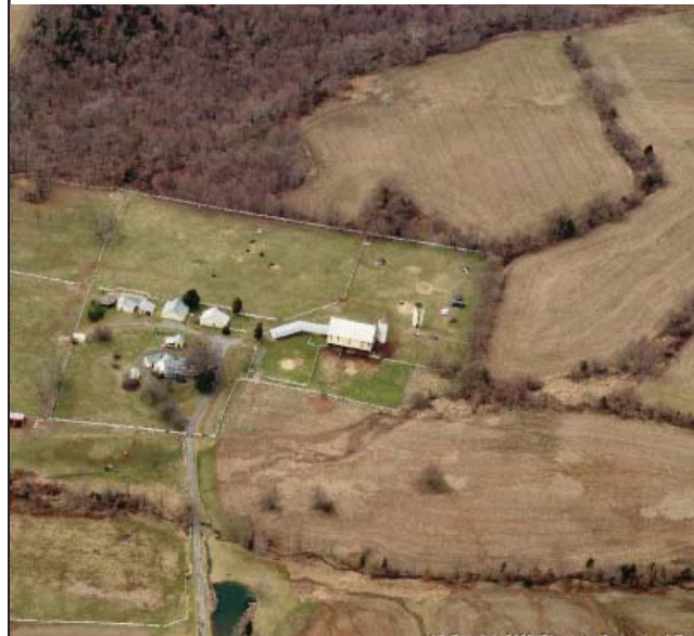
Existing development in the RDT Zone