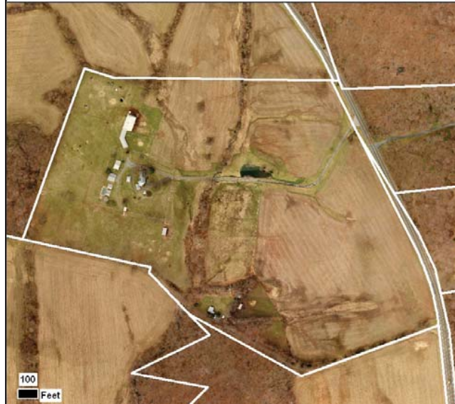
RDT Typical Buildout Plan Pattern and Form