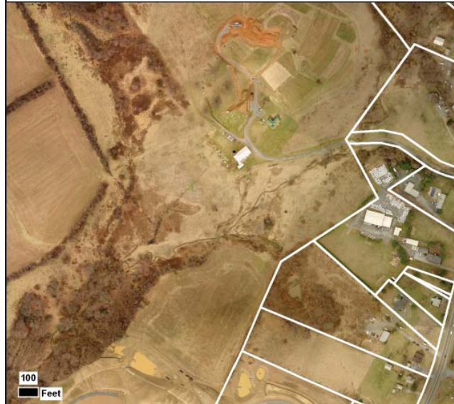
RC Typical Buildout Plan Pattern and Form