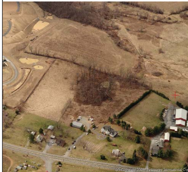
Existing development in the RC Zone