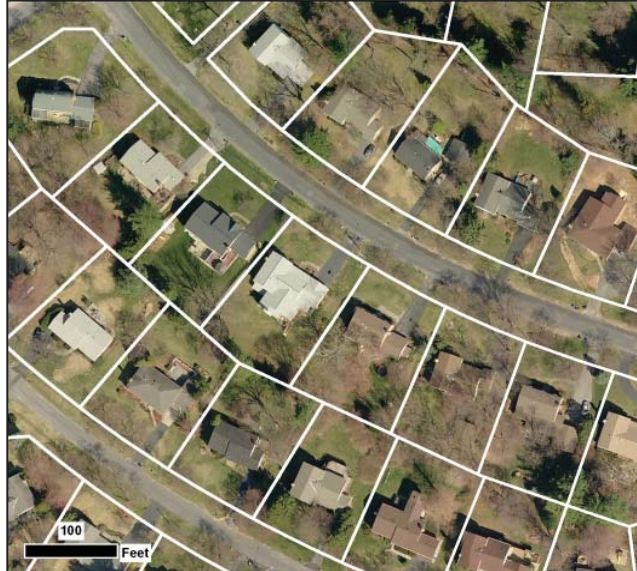
R-200 Typical Buildout Plan Pattern and Form