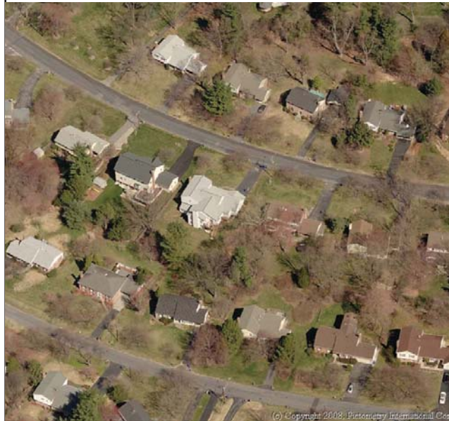
Existing development in the R-200 Zone