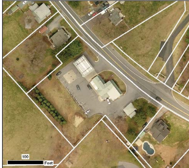
C-1 Typical Build-Out Plan Pattern and Form