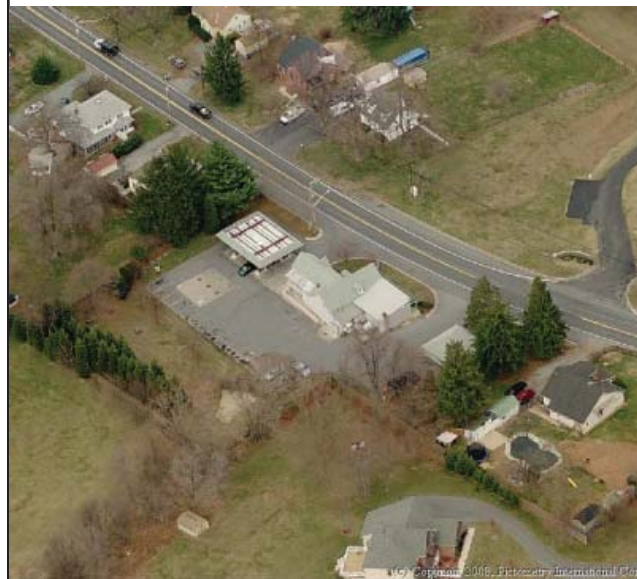
Existing development in the C-1 zone