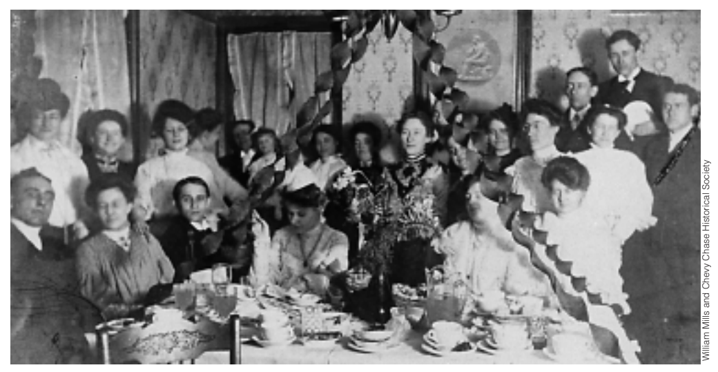
Three generations of Sonnemanns have designed significant structures in Montgomery County. Photo c1900.

ollowing is a listing of archi- \Gamma tects, landscape architects, and builders known to have worked in Montgomery County through the mid 1900s. The list is intended as the basis for research and it is hoped that it will be substantially expanded in the future. At the end of the listings is a key to sources and acronyms.