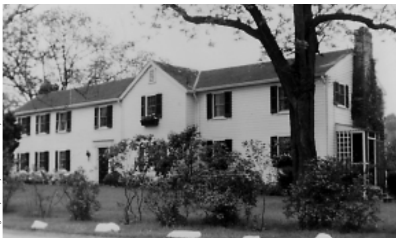
C. W. Lansdale House