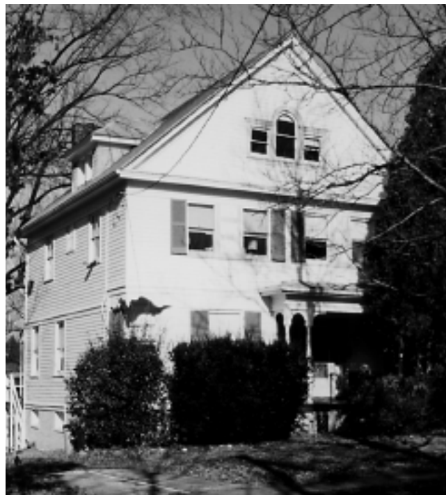
Clark House (1897)