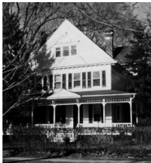
Earll House (1894)