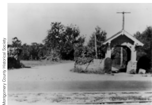
Montgomery County Historical Society

Taken as a whole, the buildings in Chevy Chase Village—sited along the planned, curving street system and surrounded by mature landscaping—represent an important cultural expression of American wealth and power in the early twentieth century and reflect in their designs the optimism and comfort considered central to domestic architecture of the post-Victorian American suburb.