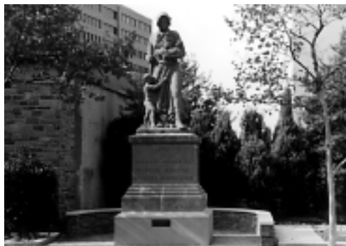
Madonna of the Trail (1929) 35/14-2