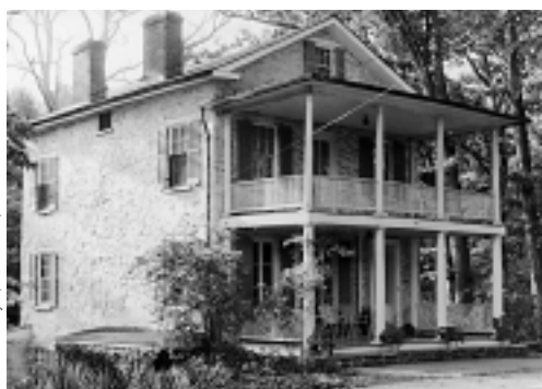
Reading House (c1853-5)