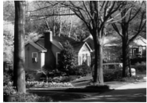
Chevy houses, 10900 block, Montrose Avenue