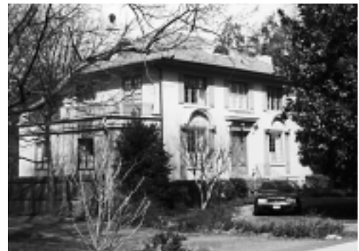
Mills House (1914)

The house represents a period of transition in the development of Chevy Chase Land Company's Section 3. While the houses immediately east of Connecticut Avenue (3807, 3803) were built with a greater setback, in line with the 1905 Gherardi House built before Section 3 was platted, the Mills House represents the early Section 3 development. The latter complies with the minimum 30-foot setback established in Section 3 deeds and corresponding with the setback of Section 2 (Village) houses facing directly across Bradley Lane.