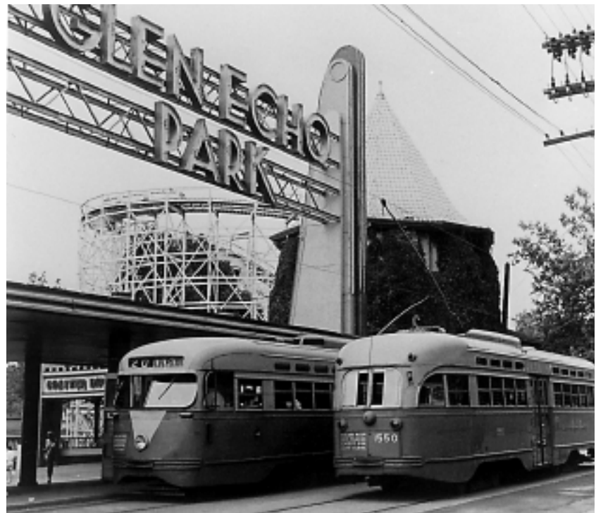
Glen Echo, 1959