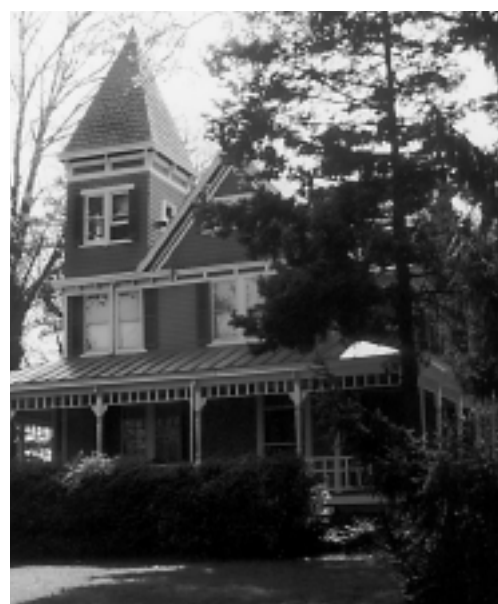
Brady House (c1892)

Like the Hollerith House, the Brady House is an enthusiastic example of Queen Anne style architecture. A steeply roofed third story turret dominates the front façade that's punctuated by paneled cornices, multi-pane