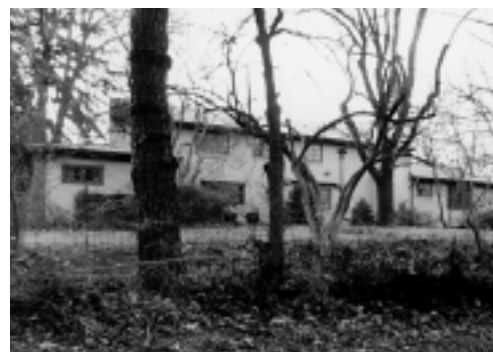
In the Woods (1910)