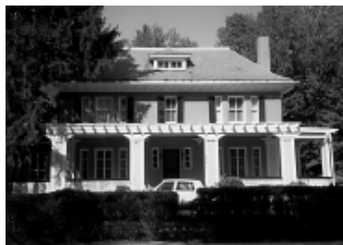
Glassie House (1910)