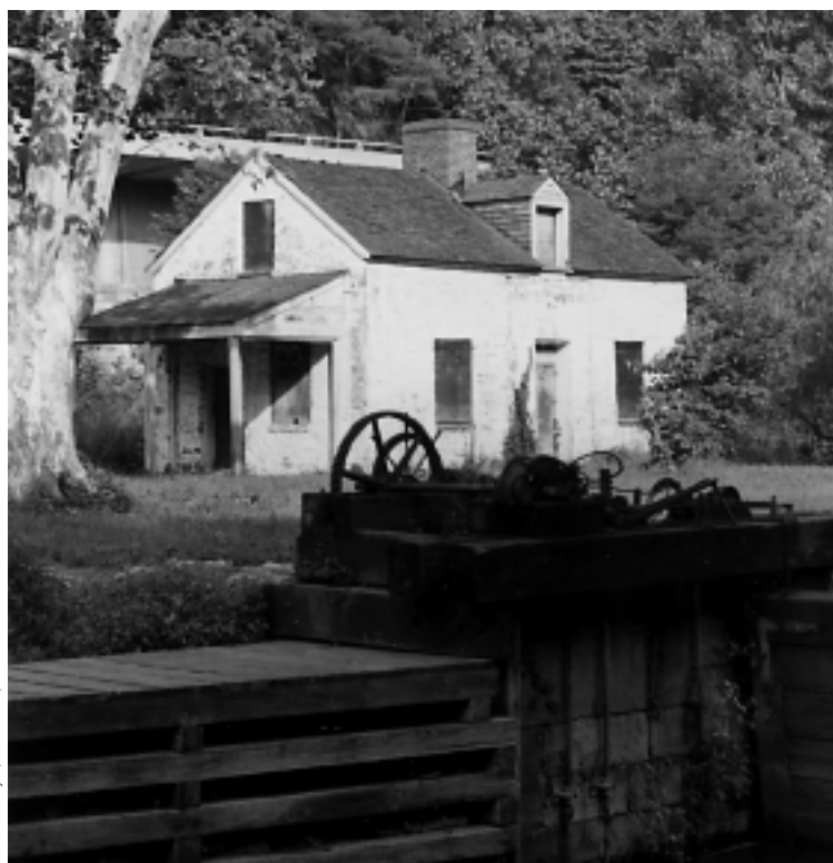
Michael Dwyer, M-NCPPC, 1974

Built of Seneca sandstone, Lock #8 is the lowest of a series of locks, known collectively as Seven Locks, located within a 13-mile section of the canal. The canal is about 100 feet wide above the lock, possibly serving as a boat basin. The stone lock house, with central chimney typical of early lock houses, has a full basement. Contractor James O'Brian built the lock house in 1830. Later additions are front and rear dormers, and a rear portico.