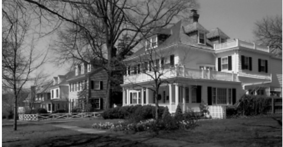
East Kirke Street view

The Land Company hired talented designers, including architects and a landscape architect, to design the community. Nathan Barrett, a New York landscape architect, created wide streets, large lots, and parkland. Trees and shrubs were carefully selected to represent the best in contemporary style and taste. Leon E. Dessez, appointed the company’s architect, prepared strict building regulations. Houses fronting on Connecticut Avenue were to cost at least $5000 and had required setbacks of 35 feet. Houses on side streets had to be worth at least $3000 and have 25 foot setbacks. Individual lots in both areas had to be at least sixty feet wide.