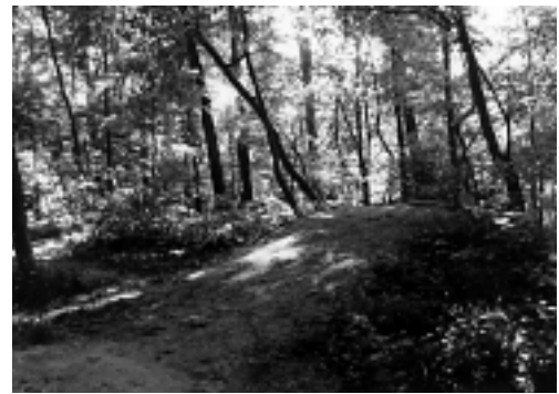
Kimberly Prothro, Traceries, for M-NCPPC, 1990

This Civil War fortification was one of a series of forts, batteries, and entrenchments constructed at half-mile intervals around Washington, D.C. President Lincoln established the defensive perimeter of military works that was 34 miles in circumference. Its purpose was to defend the city from attack by the Confederate Army. Battery Bailey is Montgomery County's only remaining fortification. A battery is formed by moving earth into a hill in order to protect artillery. The C-shaped battery is atop a north-facing hill overlooking Little Falls Branch. It contained six ramparts, which are earth mounds with platforms for field guns. Embrasures or openings in the parapets (earth walls) permitted firing of the weapons. Despite these features, there was no known action at Battery Bailey during the Civil War and the battery apparently went unarmed, and for the most part unmanned, for its duration. Battery Bailey was named for Col. Guilford D. Bailey, killed in the battle at Fair Oaks in 1862. M-NCPPC has restored the earthworks, located in Westmoreland Hills Local Park, and interprets the site with a series of historical markers.