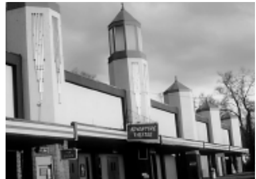
Glen Echo Arcade (1940)