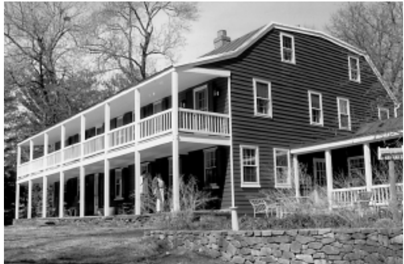
No Gain ( late 1700s/mid 1800s )

The large frame residence, with its salt-box form and two-level gallery porches overlooking a tributary of Rock Creek, reflects traditional Tidewater architecture. Portions of the west end (at left) may date to the late 1700s. The east kitchen wing is constructed with hand-hewn beams. The center section features a mantel and woodwork typical of the mid-1800s. According to tradition, a log house dates from as early as c1760. In this era, John Cartwright owned the property. A board and batten carriage house is a contributing resource.