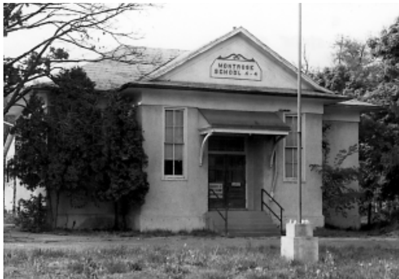
Montrose Schoolhouse (1909)

The tiny community of Montrose P.O., at Rockville Pike and Randolph Road, supported a school as early as 1865. The two-room Montrose Schoolhouse reflects a new generation of schools built in response to national standards and a growing county population. The school has foundation and roof vents and oversize windows to provide air circulation and maximize light. From 1907-8, Thomas C. Groomes designed the pebble-dashed schoolhouse. The school cost $2,200 to construct in 1909. The School Board added a third classroom and indoor plumbing in 1948. The Montrose School closed in 1966. Peerless Rockville bought and restored the building.