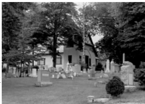
Mount Zion Cemetery (1864+)