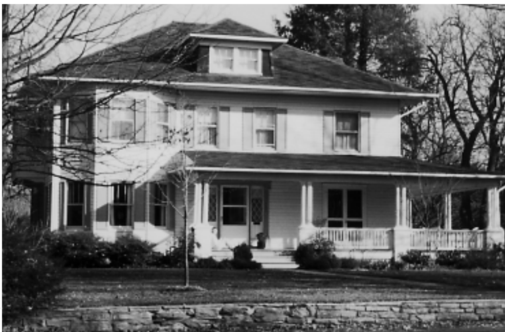
Campbell House (1907)