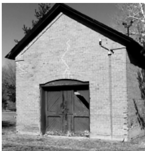
Cabin John Hotel Gas House (c1880-95)