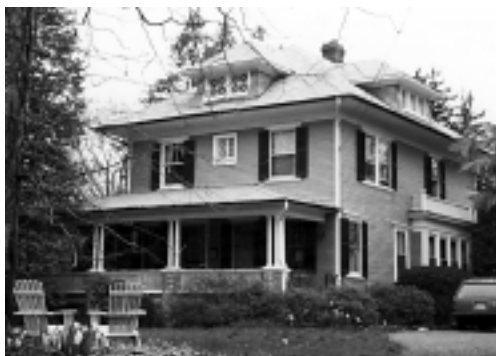
Simpson Family House (c1905)