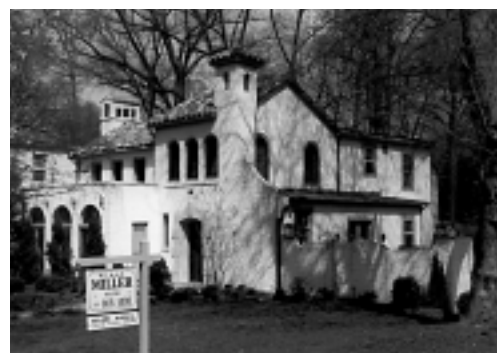
Reginald Geare House (c1927), 35/130 4101 Stanford