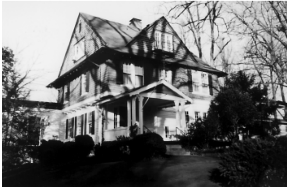
Michael Simon, M-NCPPC, 1994

Today, the mature trees, landscaping, and original grid system of streets complement the visual streetscape established a century ago. Other important features enhancing the historic character of the Somerset community include: the spacing and rhythm of the buildings, the uniform scale of the existing houses, the relationship of houses to the street, the ample-sized lots and patterns of open space in the neighborhood.