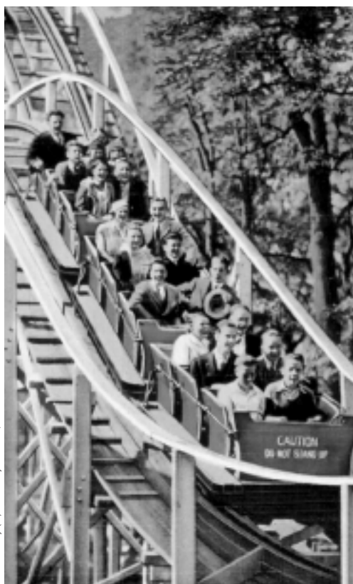
Glen Echo Park roller coaster, 1934 postcard