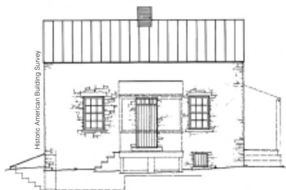
Lock House at Lock 10