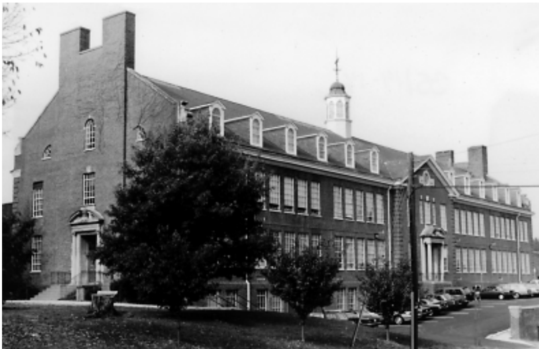
Bethesda-Chevy Chase High School 35/14-14 (1935)

The Bethesda-Chevy Chase High School was one of two schools in the county built with PWA funds, the other being the original Montgomery Blair High School. In a continual response to the area's population growth, the school was expanded in 1938, 1941, and 1946. Restoration and expansion of the school in 2001 includes new facilities housing an auditorium, two gymnasiums, and a media center.