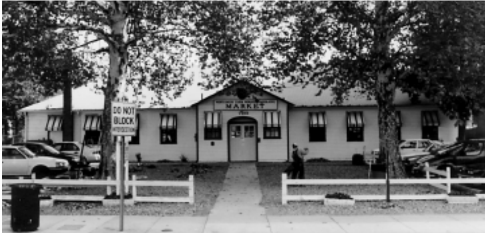
Farm Women's Market (1934) 35/14-1

A group of Montgomery County women formed the Farm Women's Cooperative as a self-help response to the severe economic conditions of the Great Depression. In 1932, they held the first market in an empty storefront, selling fresh produce and home-made products directly to suburban families. The one-story, 4,750 square foot, frame building at 7155 Wisconsin Avenue was built to house the market in 1934 and has been in continuous use as a farm market ever since. It remains an important link to the County's agricultural heritage.