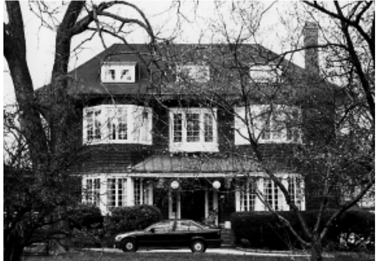
Gherardi House (1905)

The Gherardi House is an outstanding example of Shingle Style architecture, evidenced in its robust massing, smooth shingle cladding, strips of multi-pane windows, and stacked bays. The residence bears striking similarity in fenestration and sheathing with McKim, Mead, and White's Low House, in Rhode Island, which is recognized as a national landmark Shingle Style house.