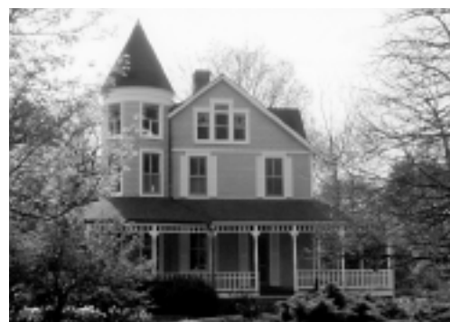
Hollerith House (1891)

Built in 1891, this Garrett Park house was the residence of Herman Hollerith, inventor of the Hollerith Code, a key punch card system used by the Census Bureau in 1890 and 1900. Town minutes of 1899 note that the first telephone in Garrett Park was wired from this house to Hardesty's Store by the railroad depot. The dwelling is an excellent, well-preserved example of Queen Anne style architecture dominant in the early days of Garrett Park. Prominent is a three-story shingled tower wrapped on the first level by a porch with latticework frieze and turned posts.