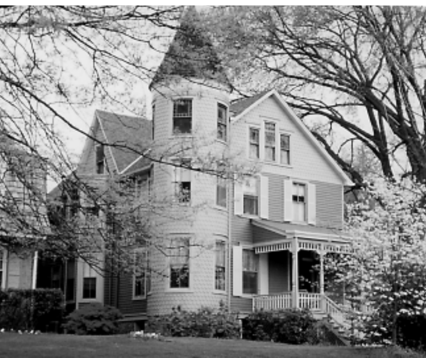
10909 Kenilworth, Garrett Park

architectural and engineering features as well as an important natural environment. Many of the structures in the National Register Historic District are described individually in the following section.