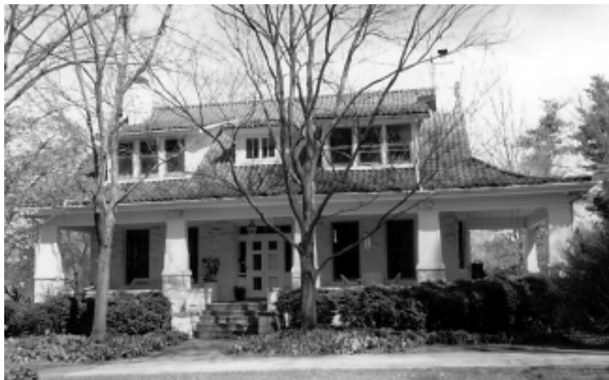
Bradshaw House/End Lane (1903) 35/73