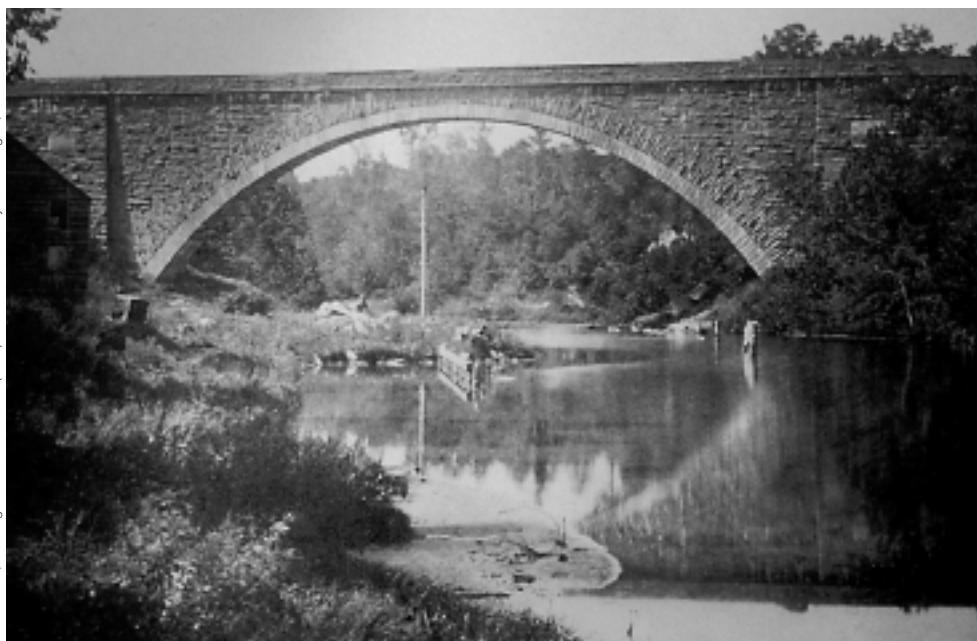
Cabin John Aqueduct (1853-63),