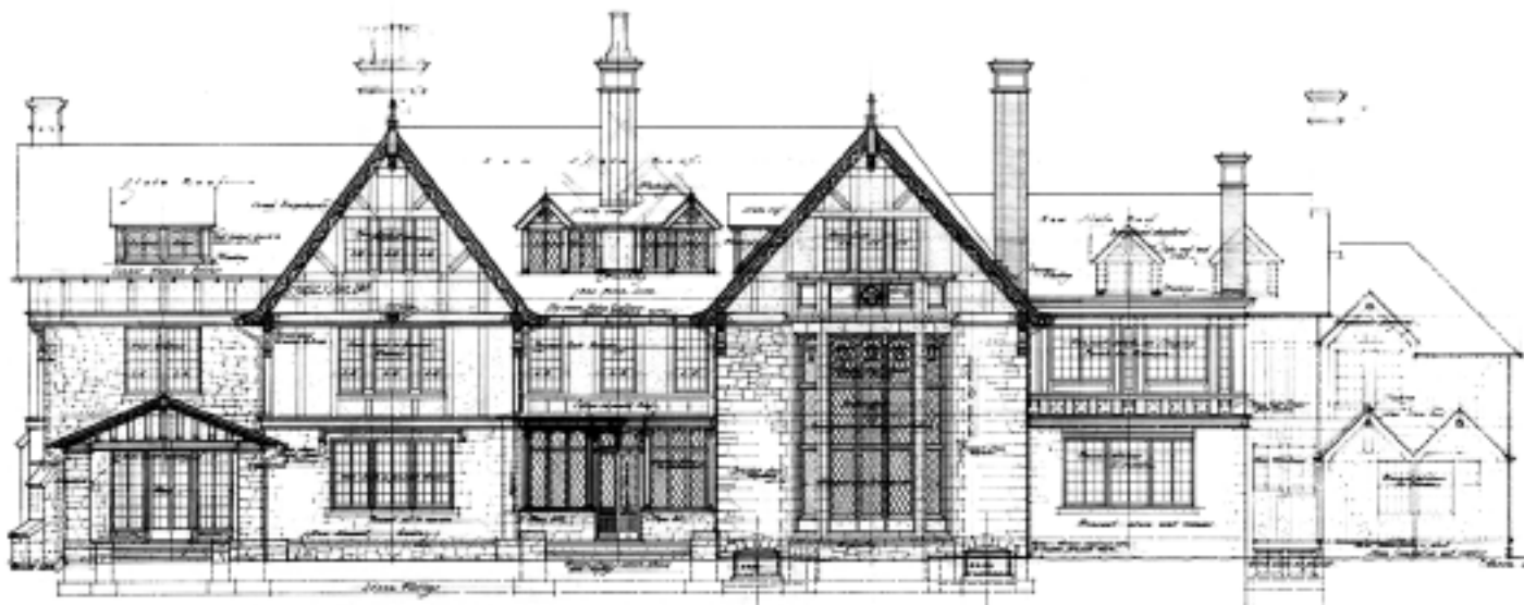
Arthur B. Heaton, 1914