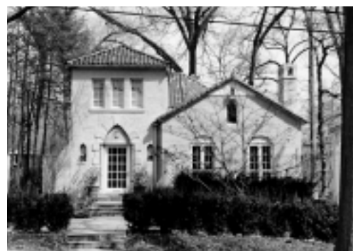
Geare-Horton House (c1927), 35/128 4105 Stanford