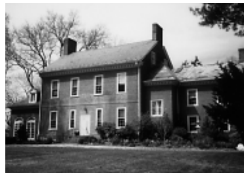
Hayes Manor (c1767)