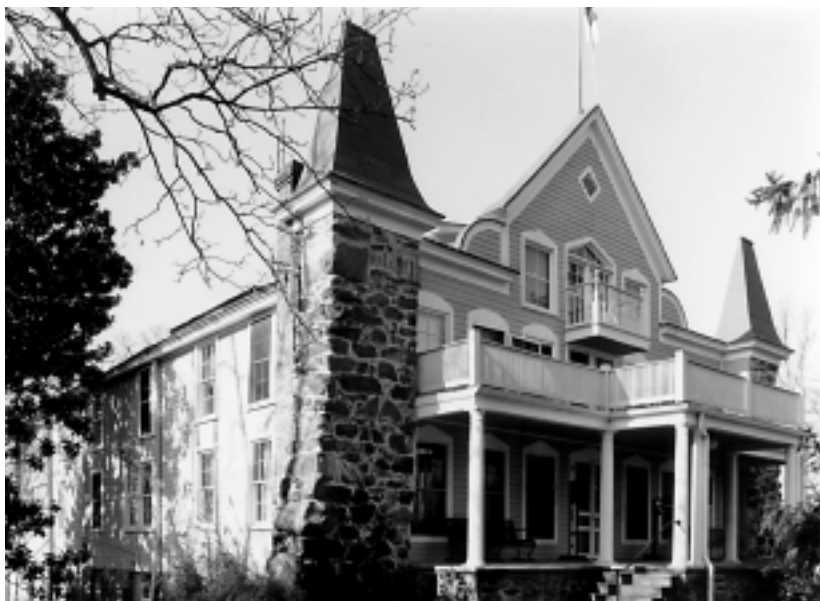
Clara Barton House (1891)