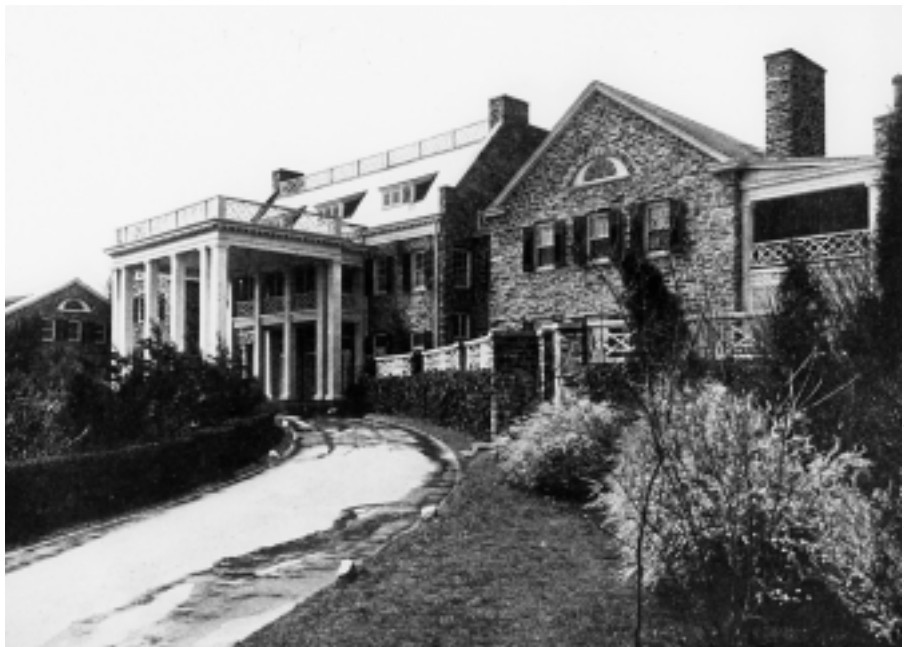
Chevy Chase Club, East façade, photo 1914