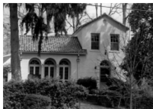
Geare-Davidson House (c1927), 35/129 4103 Stanford