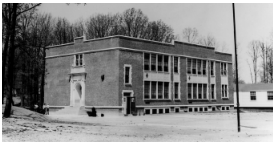
Chevy Chase Elementary School (1930-6)