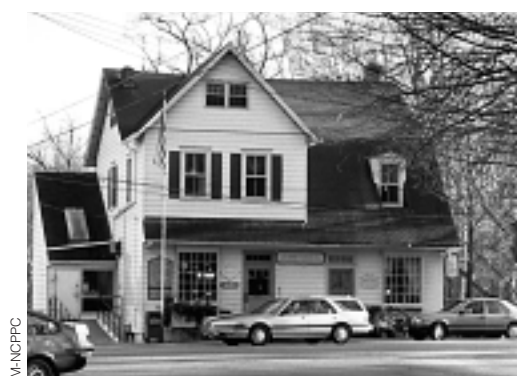
Garrett Park Store and Post Office 30/13 (1890)

Garrett Park reflects nearly a century of diverse architectural styles. The earliest houses were built primarily in the Queen Anne style, typically 2½-story, asymmetrical residences with towers or turrets, and generous porches. One of the finest Queen Anne examples is the Stoddard-Freiberg House (1889), 4711 Waverly Avenue, adorned with a bell-capped turret and lavishly bracketed cornices. After World War I, a group of four