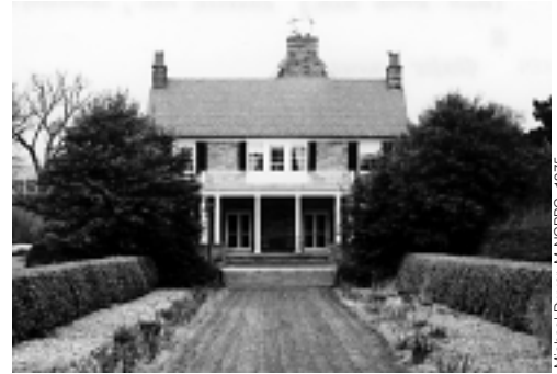
Michael Dwyer, M-NOPPC, 1975

The Peter House has a well-detailed, complex form and is constructed of high-quality, durable materials. The three-part house is composed of a side-gable main block flanked by smaller-scale front gable wings. Walls are uncoursed ashlar blocks of gray Indiana limestone with steel bracing. Slate-covered gable roofs have pedimented dormers and are finished with denticulated cornices. The main (east) elevation, facing Rockville Pike, has a pedimented two-story portico with Corinthian style columns. The driveway approach is to the more subdued west elevation where the entrance is through a one-story, barrel-vaulted portico. The residence has a cross-passage plan with a finely crafted suspended staircase with curved railing. Wings contain service stairs and domestic rooms now converted to conference rooms. The estate includes a 1½-story caretaker’s house built in a compatible style and material.