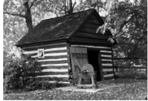
Smokehouse ( Late 1700s or Early 1800s )