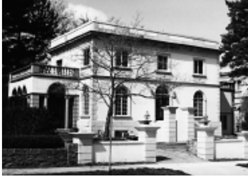
K. Shuler, M-NCPPC, 1997