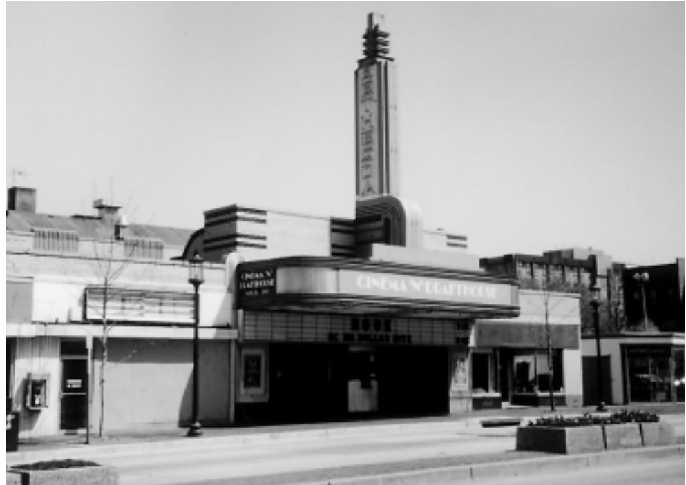
Bethesda Theatre (1938)

John Ebersson, a nationally noted theater architect, designed this modernistic movie theater in 1938. Its distinctive tower, marquee, and banded brick façade are characteristic of this style of architecture. Like the Silver Theatre (1938), in Silver Spring, also an Ebersson design, the Bethesda Theatre is a fine example of streamlined Moderne styling with Art Deco detailing. The sleek mechanical curves of the marquee, tower, and detailing reflect the dynamic industrial and technological advances of the period. Both buildings employ blond brick with linear bands of black brick and have an aluminum and glass marquee. While the Bethesda Theatre was planned as part of a larger shopping complex, the project was downsized with only single flanking stores, yet it included a free 500-car parking lot. The 1,000 seat theater provided state-of-the-art facilities, including a high fidelity sound system, the latest projection equipment, and air conditioning.