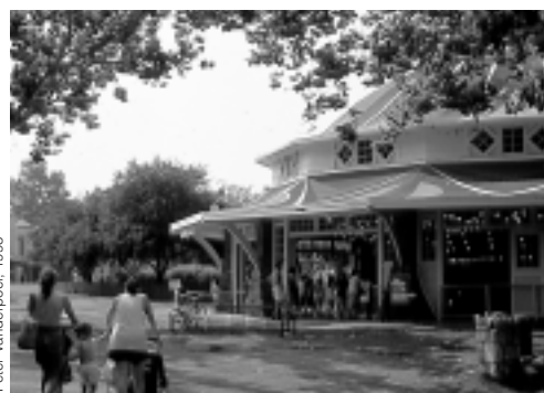
Dentzel Carousel (1921)