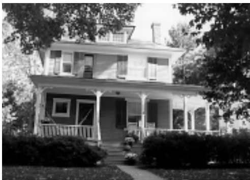
Clare Lise Cavicchi, MNCPPC, 1998

The roof is covered with asphalt shingles. The house was moved approximately 40 feet east of its original location, between 1927 and 1958.