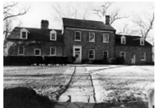
Milton ( c1700; 1847 )