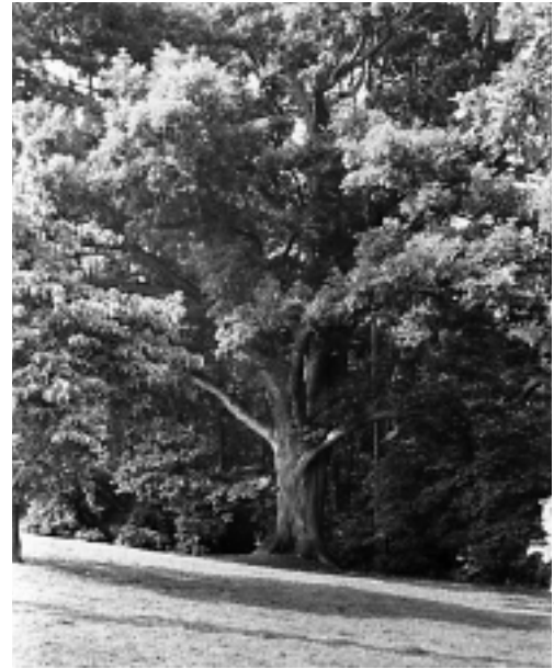
Linden Oak (Circa Early 1700s)