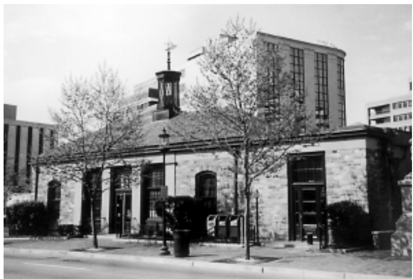
Bethesda Post Office (1938)