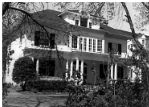
Mactier House (1905)