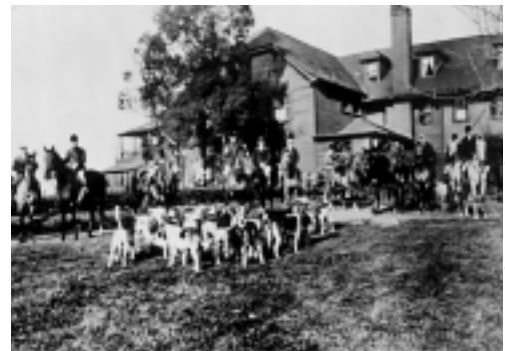
Chevy Chase Hunt (1900)