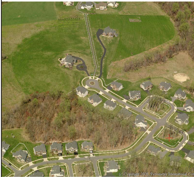
Existing development in the RNC Zone