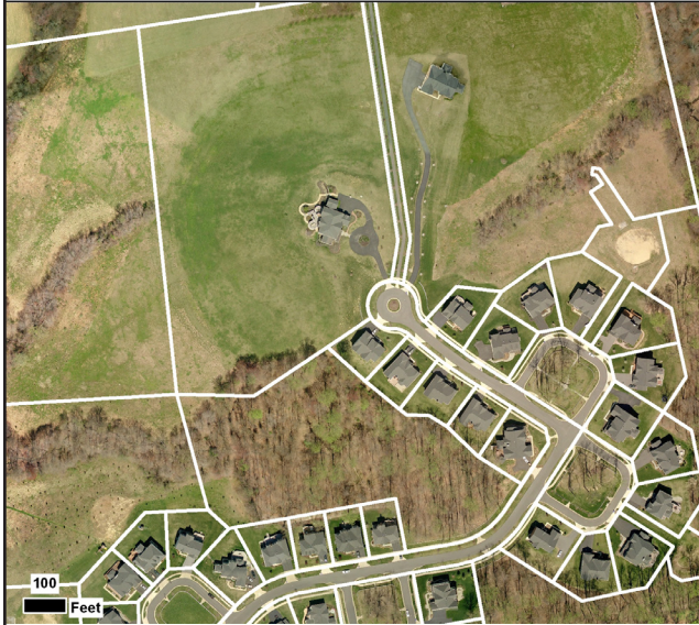
RNC Typical Buildout Plan Pattern and Form