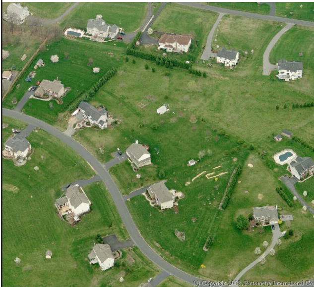
Existing development in the RE-2C Zone