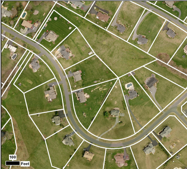
RE-2C Typical Buildout Pattern and Form