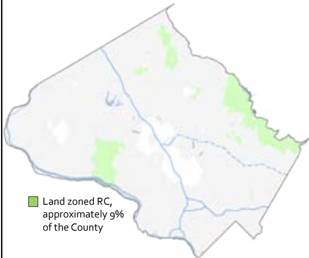
Existing development in the RC zone

The intent of the RC zone is to provide designated areas of the County for a compatible mixture of agricultural uses and very low-density residential development, to promote agriculture, and to protect scenic and environmentally sensitive areas.