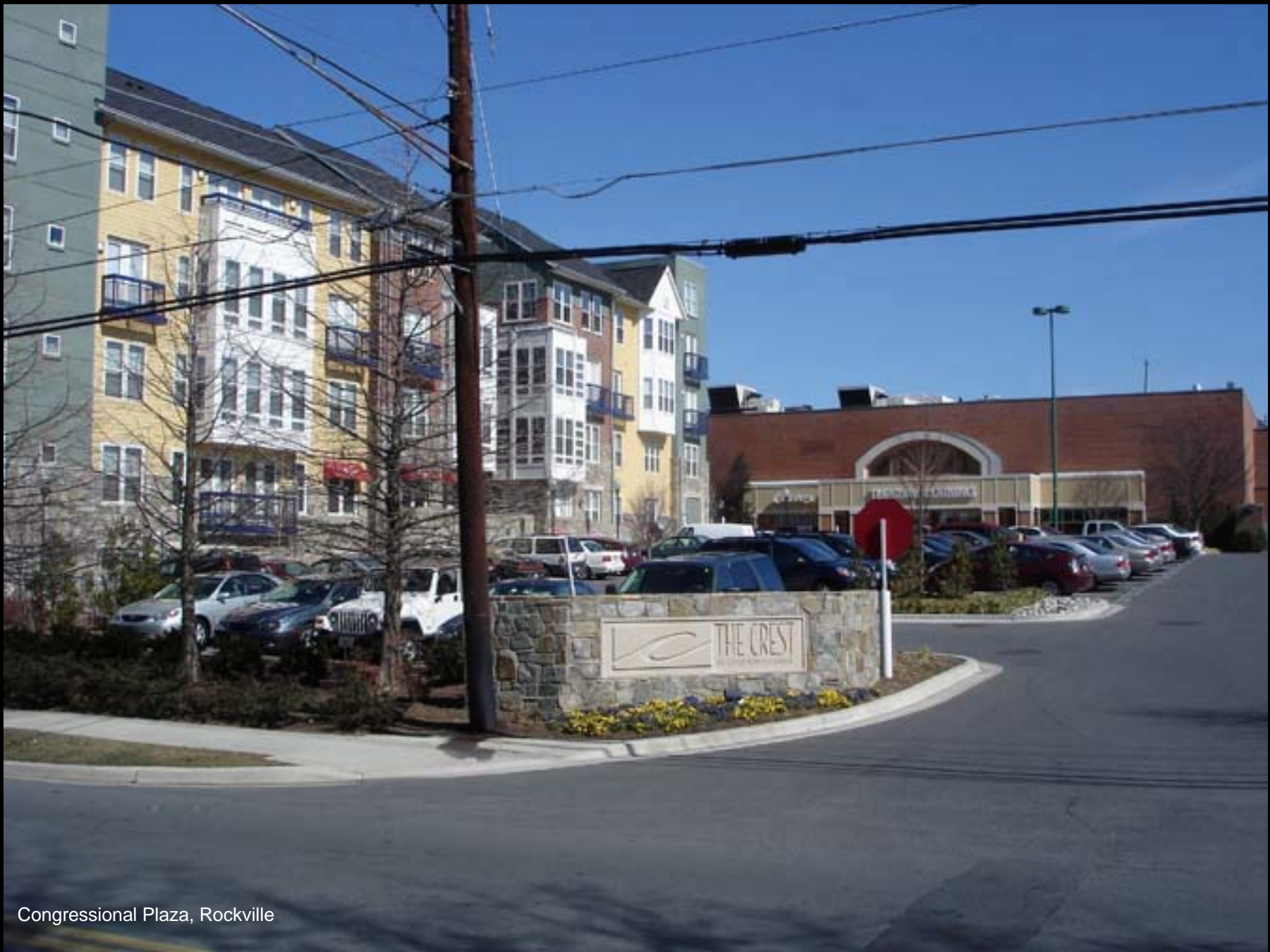
Congressional Plaza, Rockville