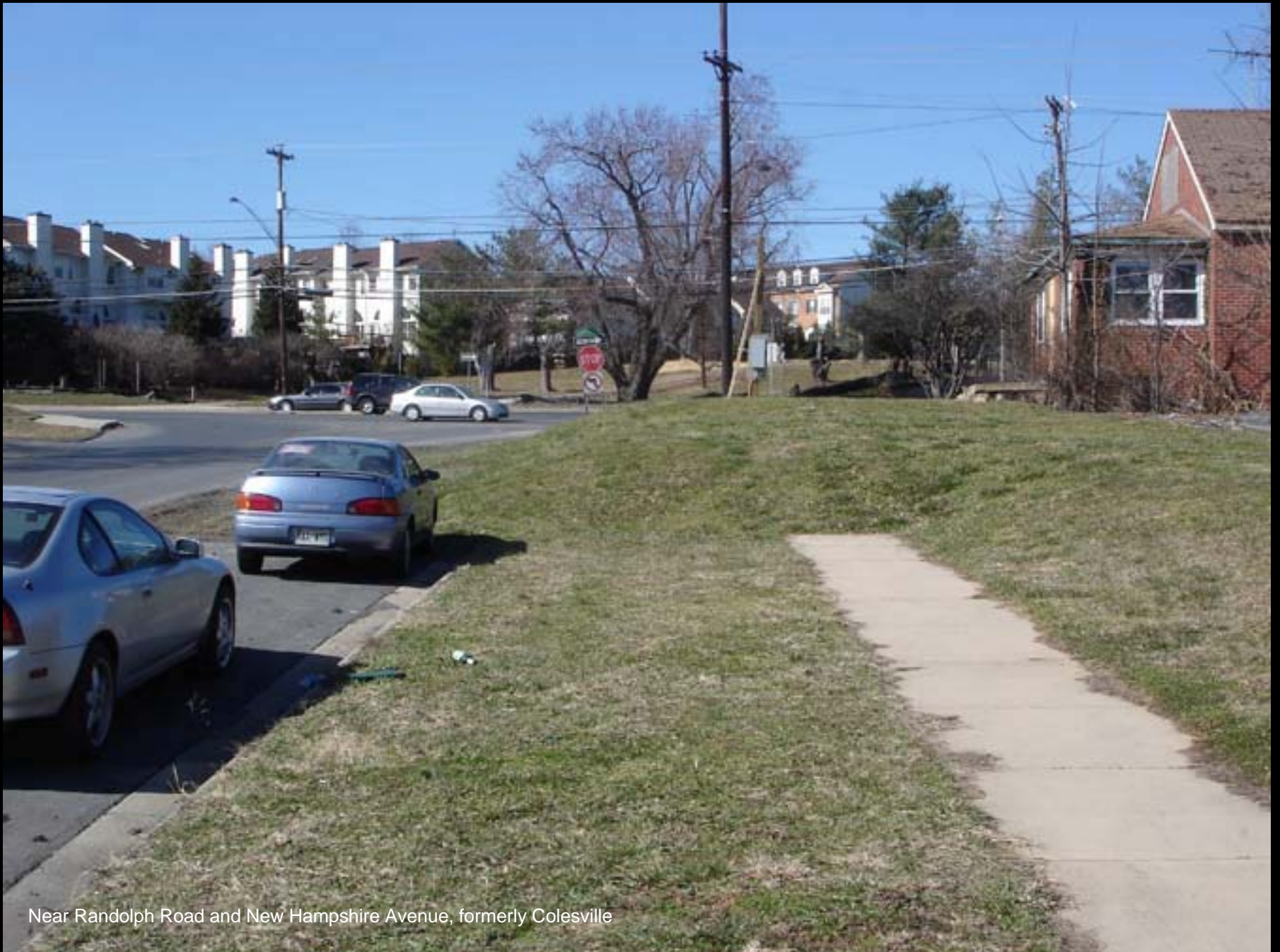
Near Randolph Road and New Hampshire Avenue, formerly Colesville