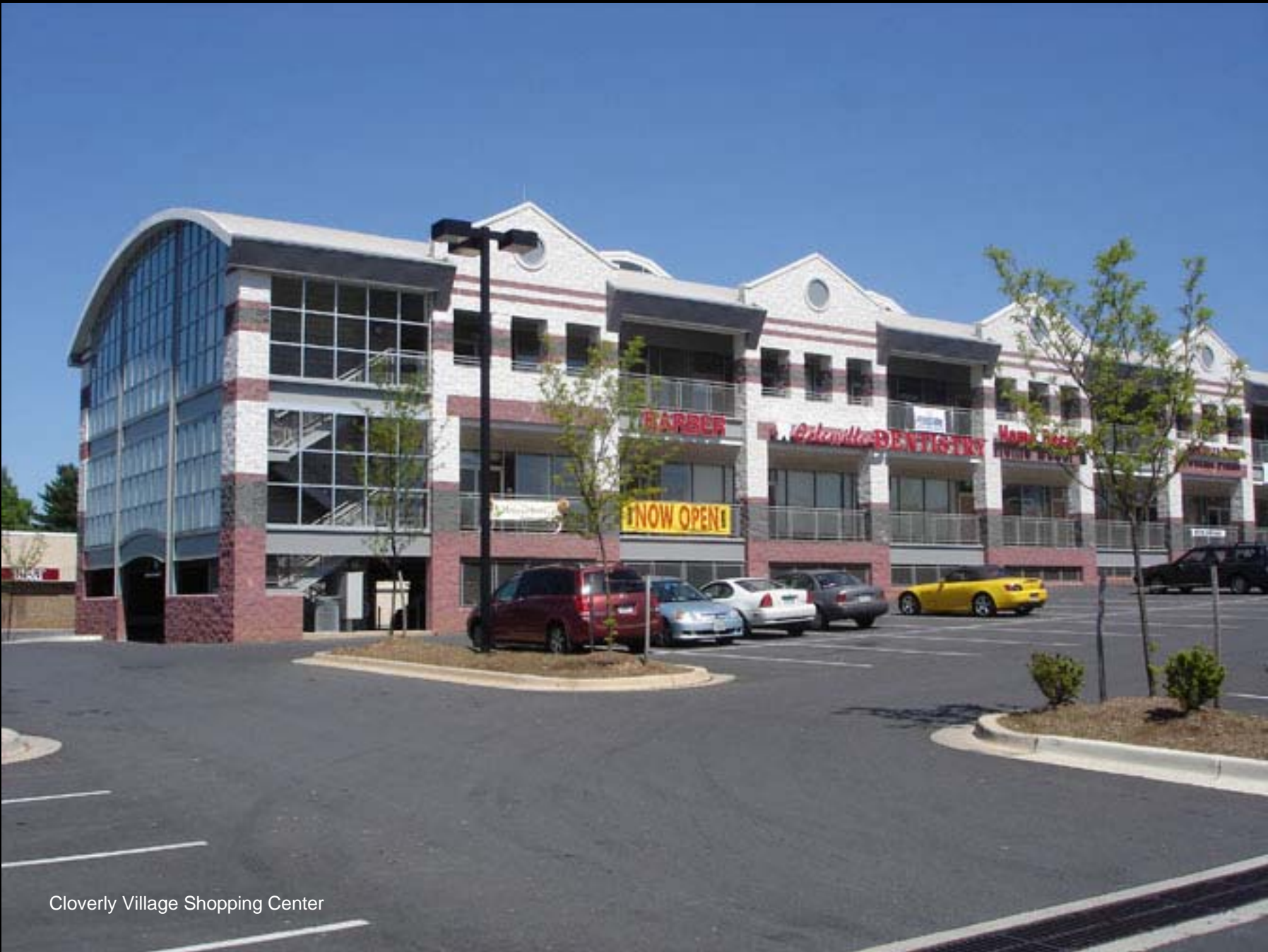
Cloverly Village Shopping Center