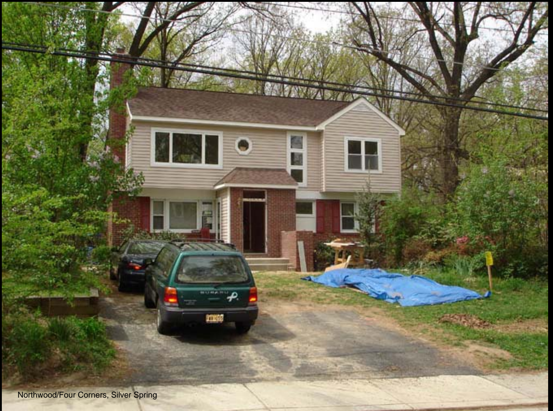
Northwood/Four Corners, Silver Spring