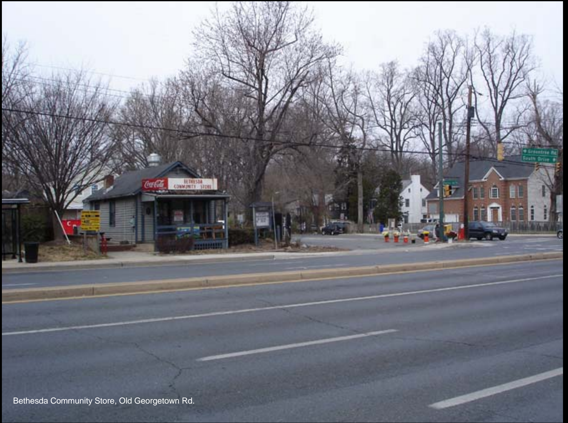
Bethesda Community Store, Old Georgetown Rd.