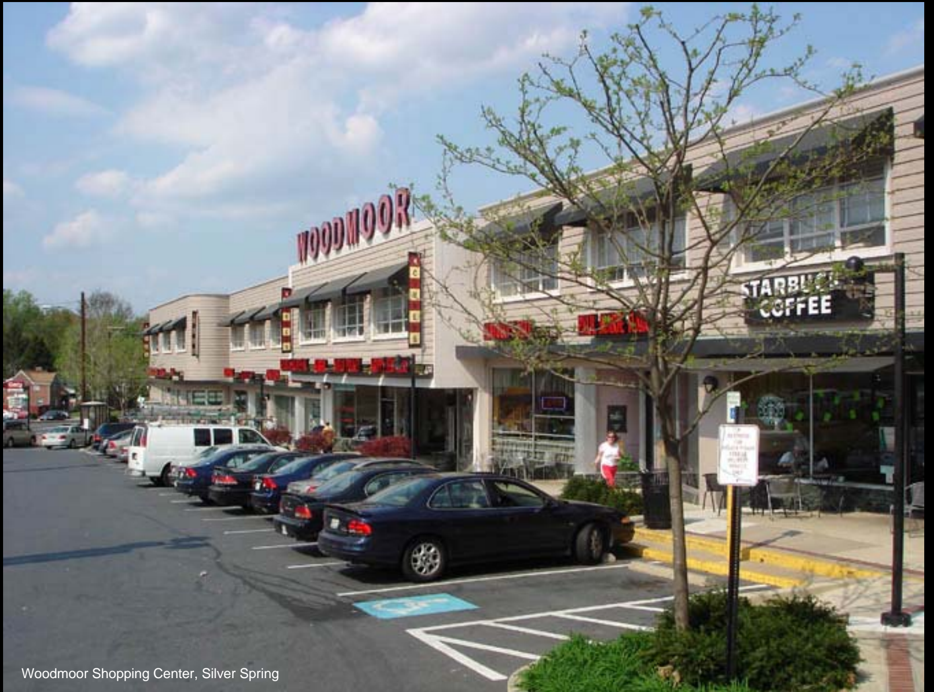
Woodmoor Shopping Center, Silver Spring