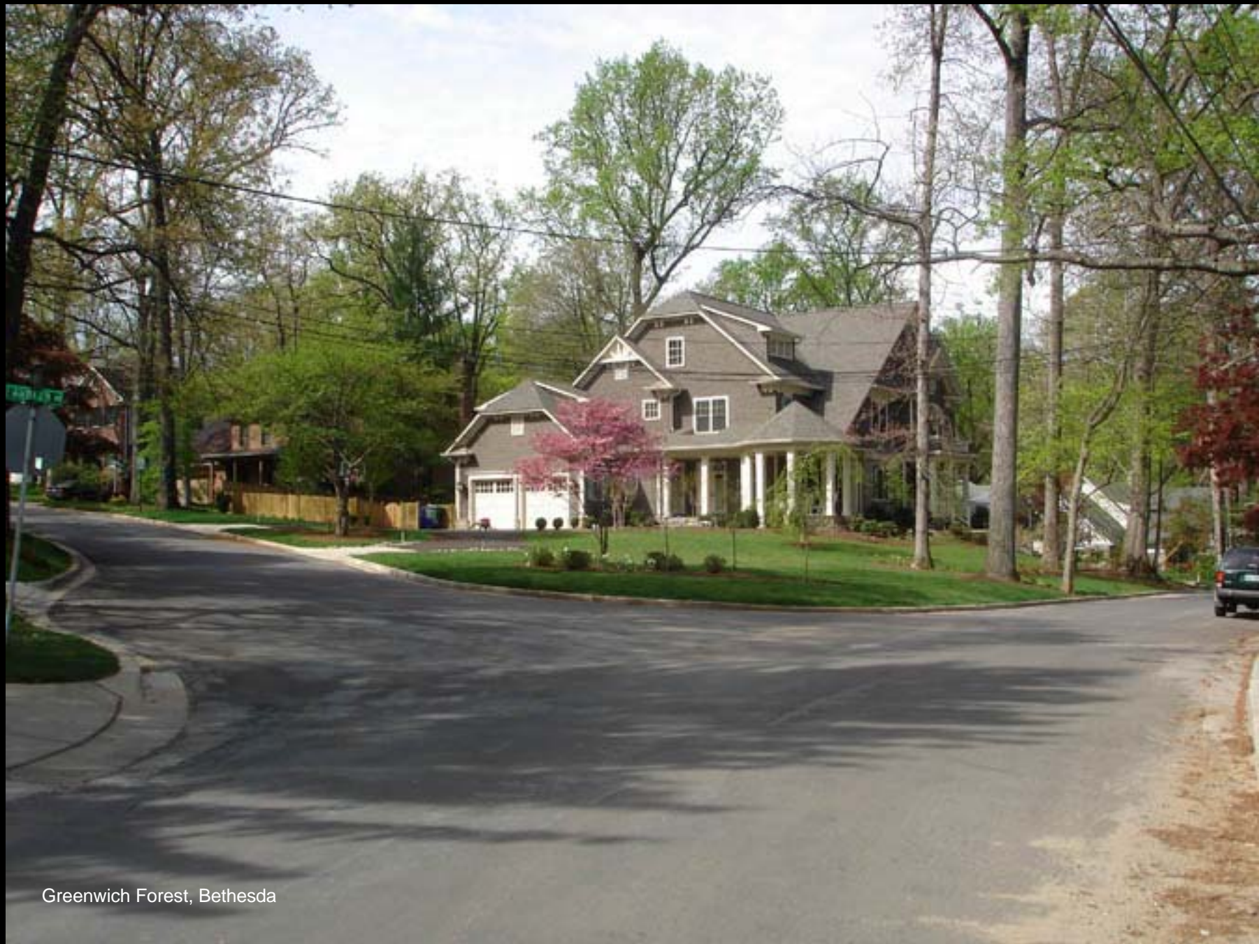
Greenwich Forest, Bethesda