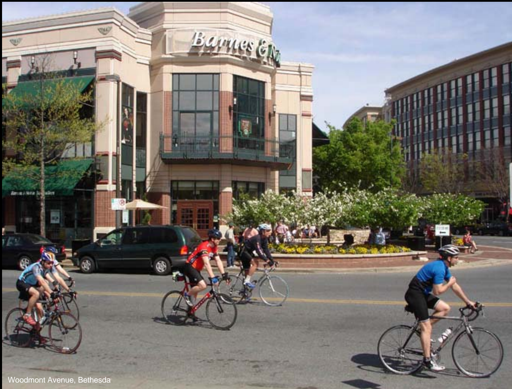
Woodmont Avenue, Bethesda