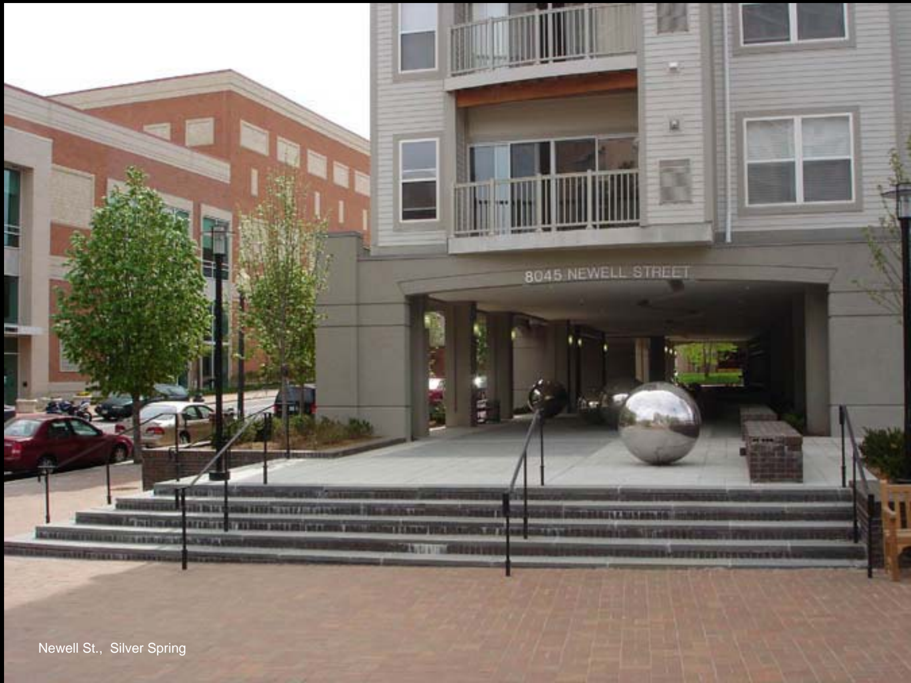
Newell St., Silver Spring