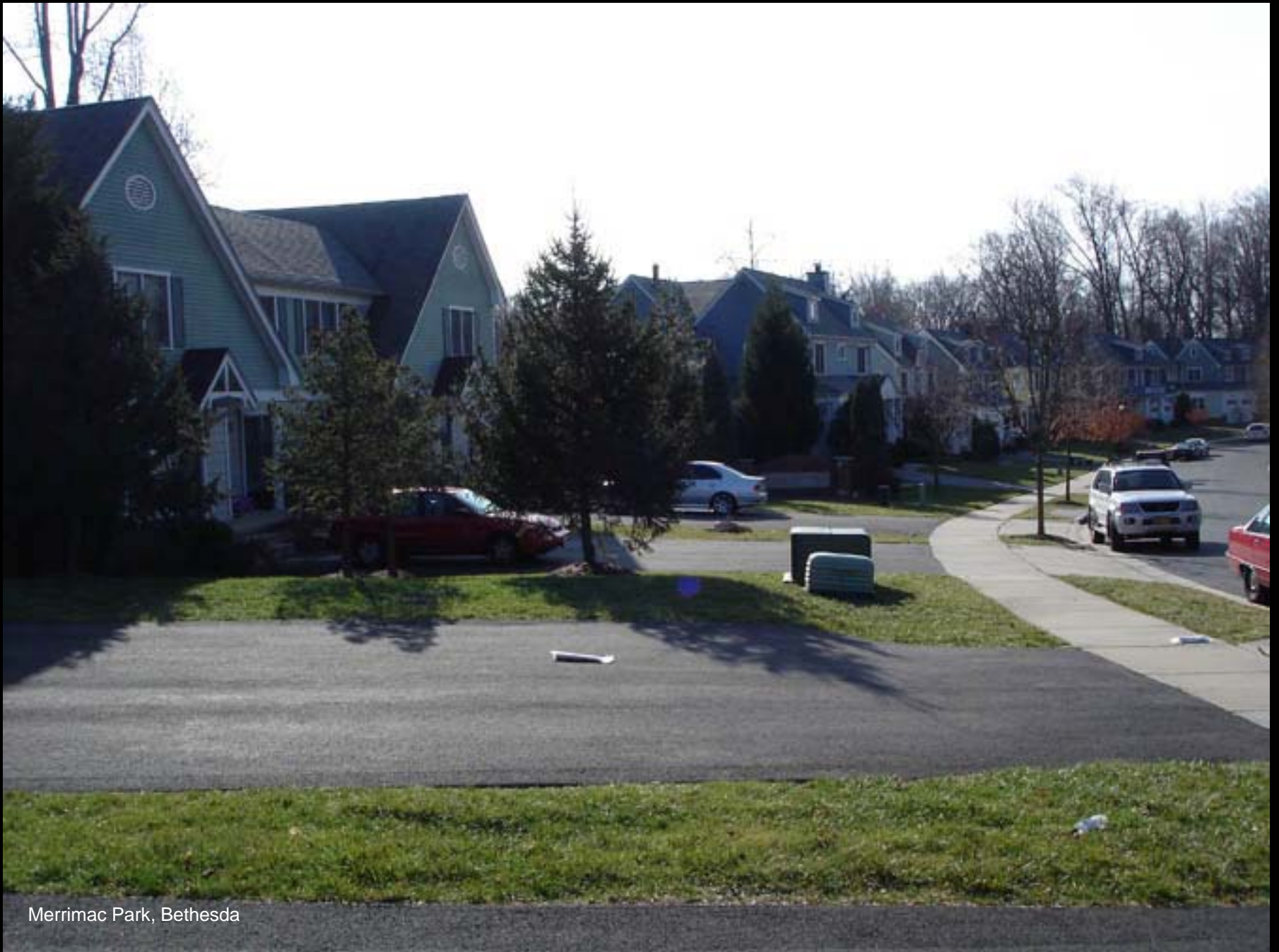
Merrimac Park, Bethesda