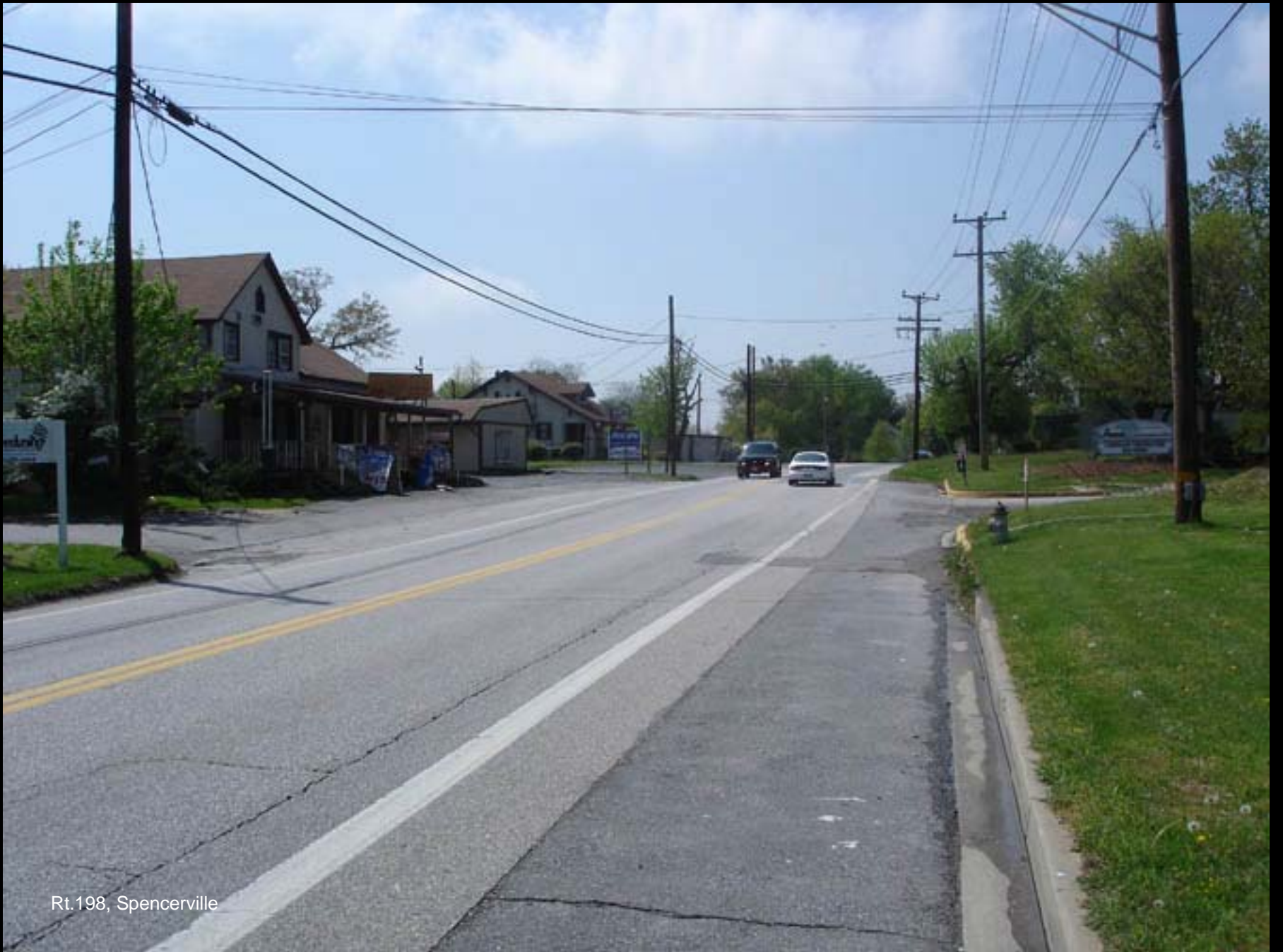
Rt. 198, Spencerville