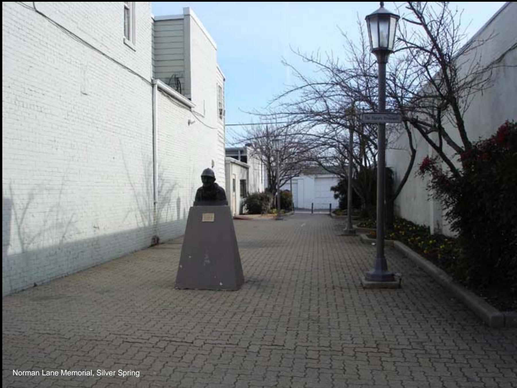
Norman Lane Memorial, Silver Spring