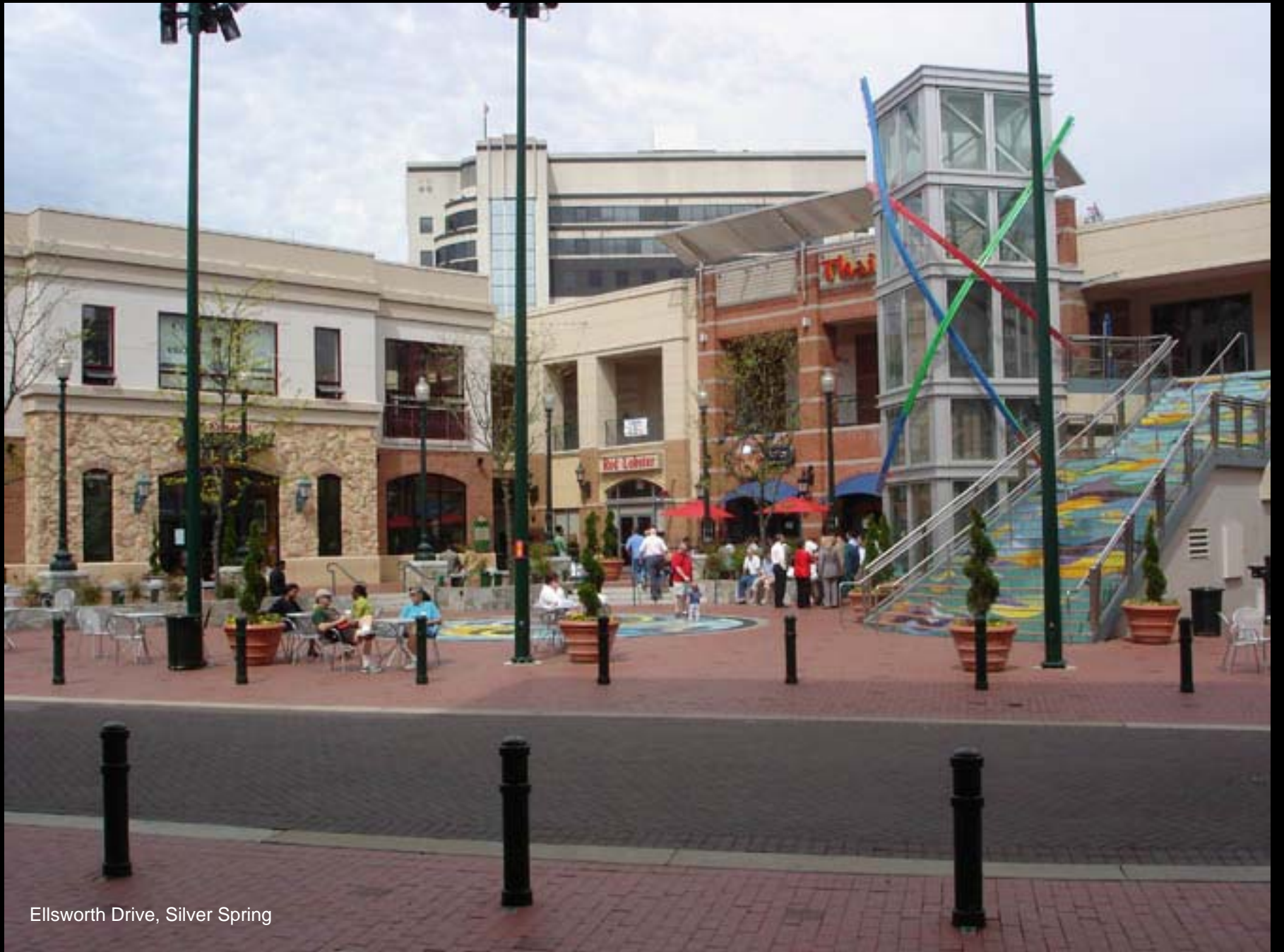
Ellsworth Drive, Silver Spring