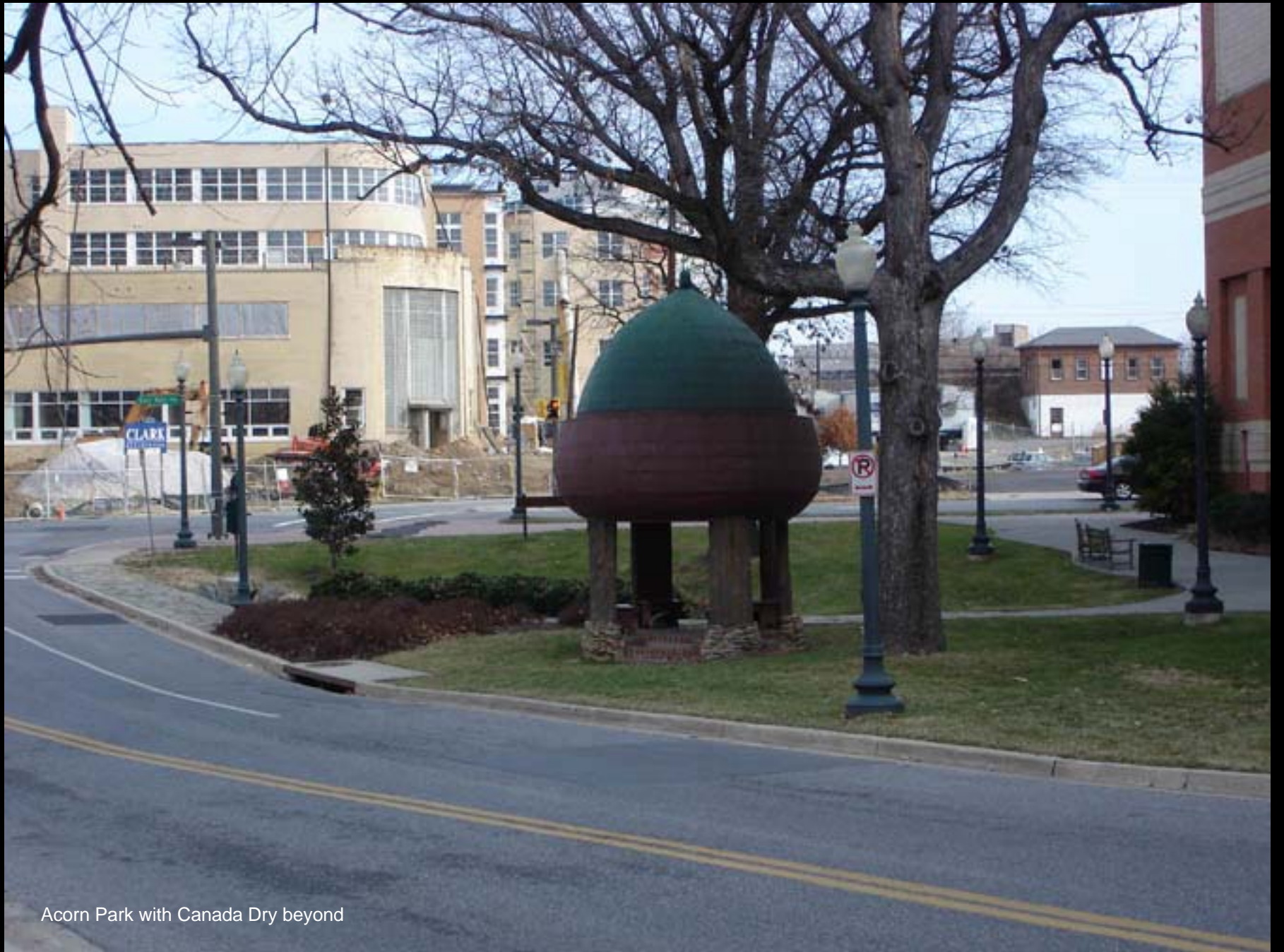
Acorn Park with Canada Dry beyond