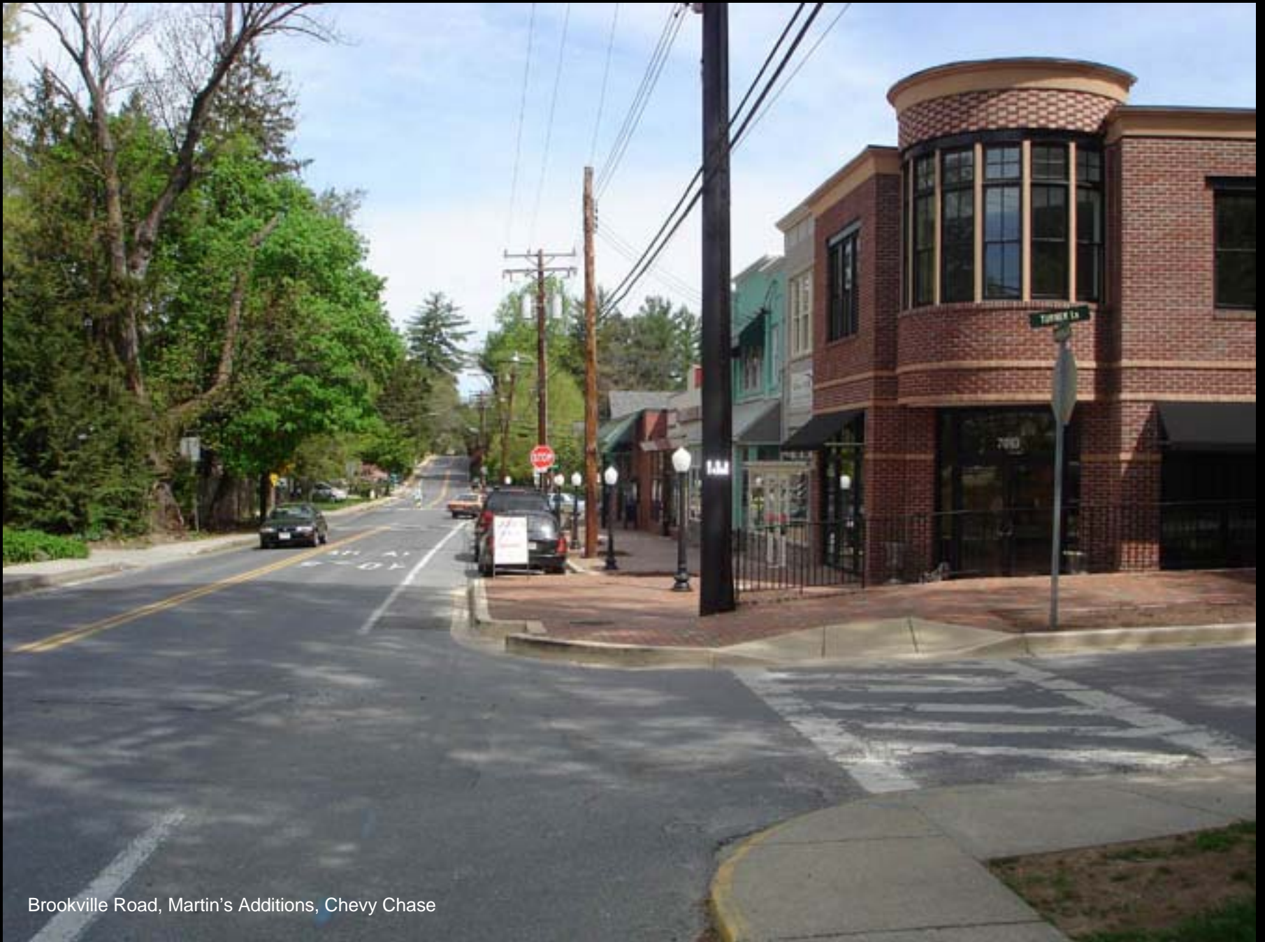
Brookville Road, Martin's Additions, Chevy Chase