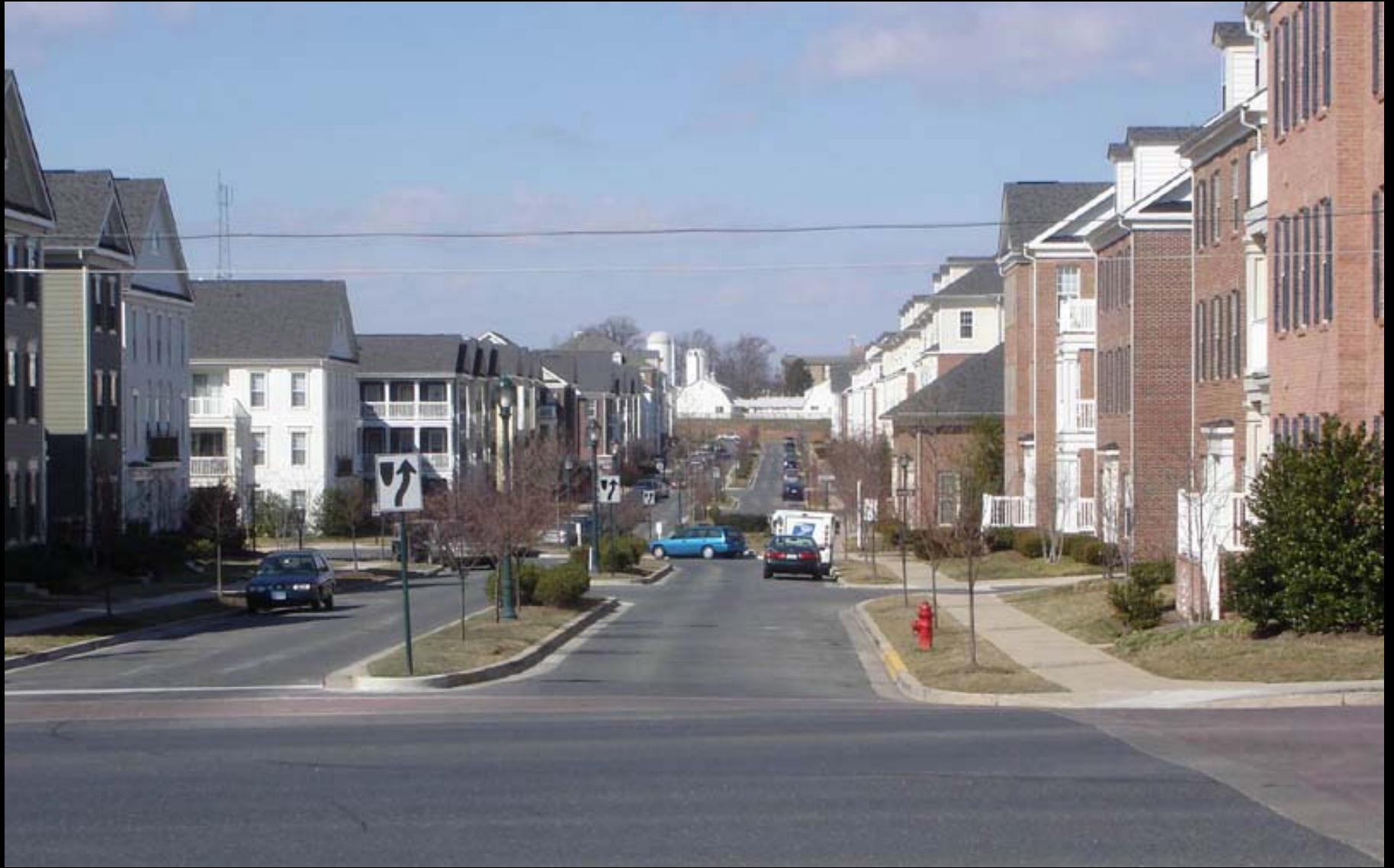
King Farm, Rockville