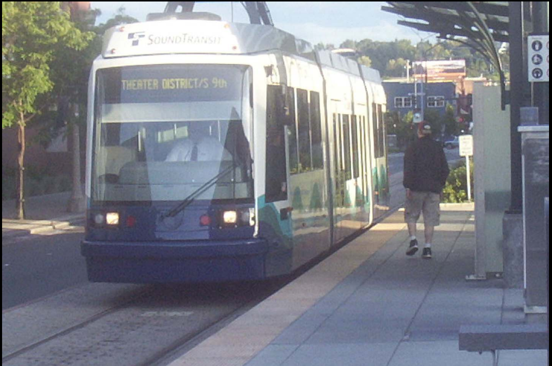
Light Rail, Tacoma, WA