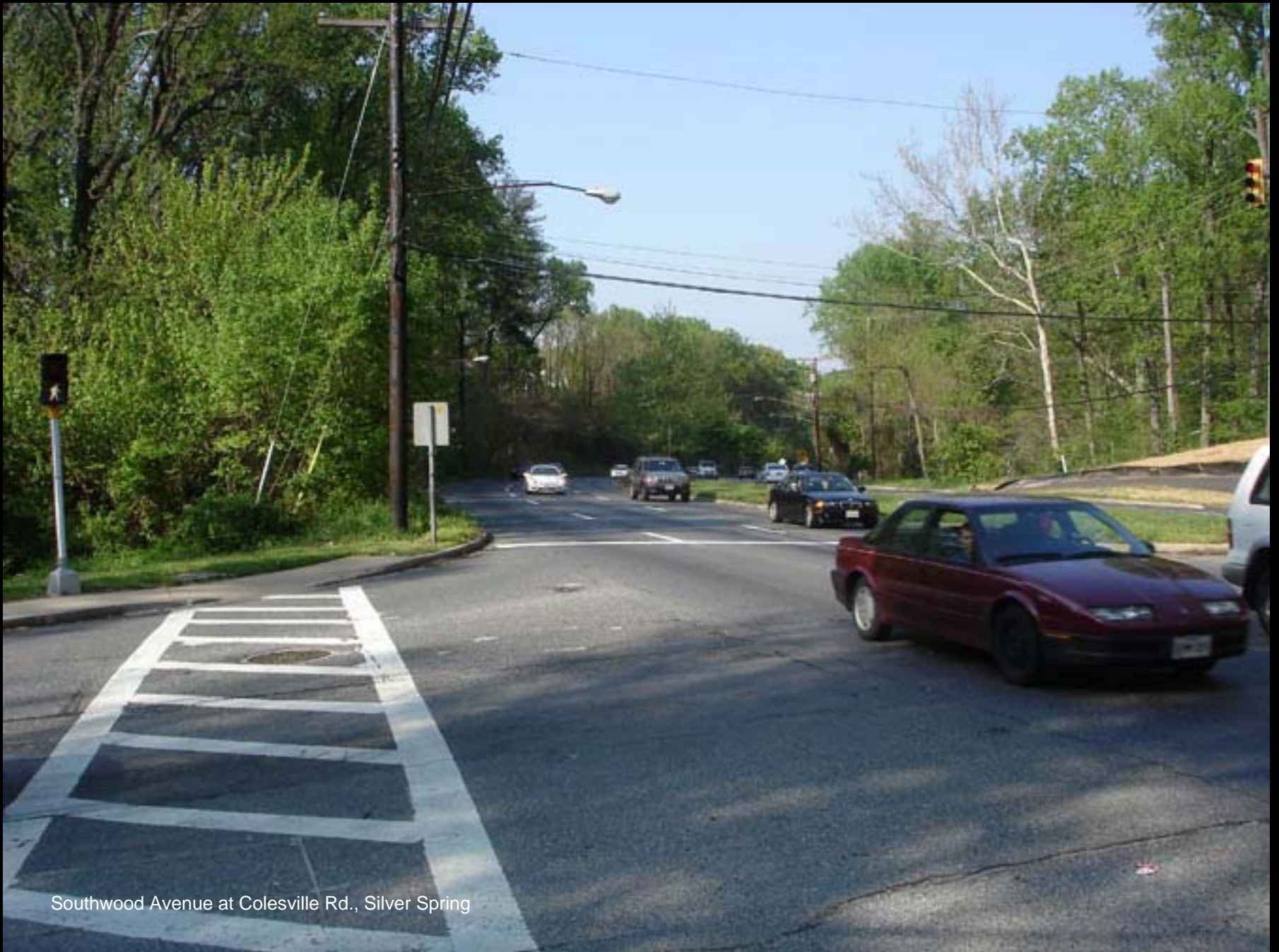
Southwood Avenue at Colesville Rd., Silver Spring