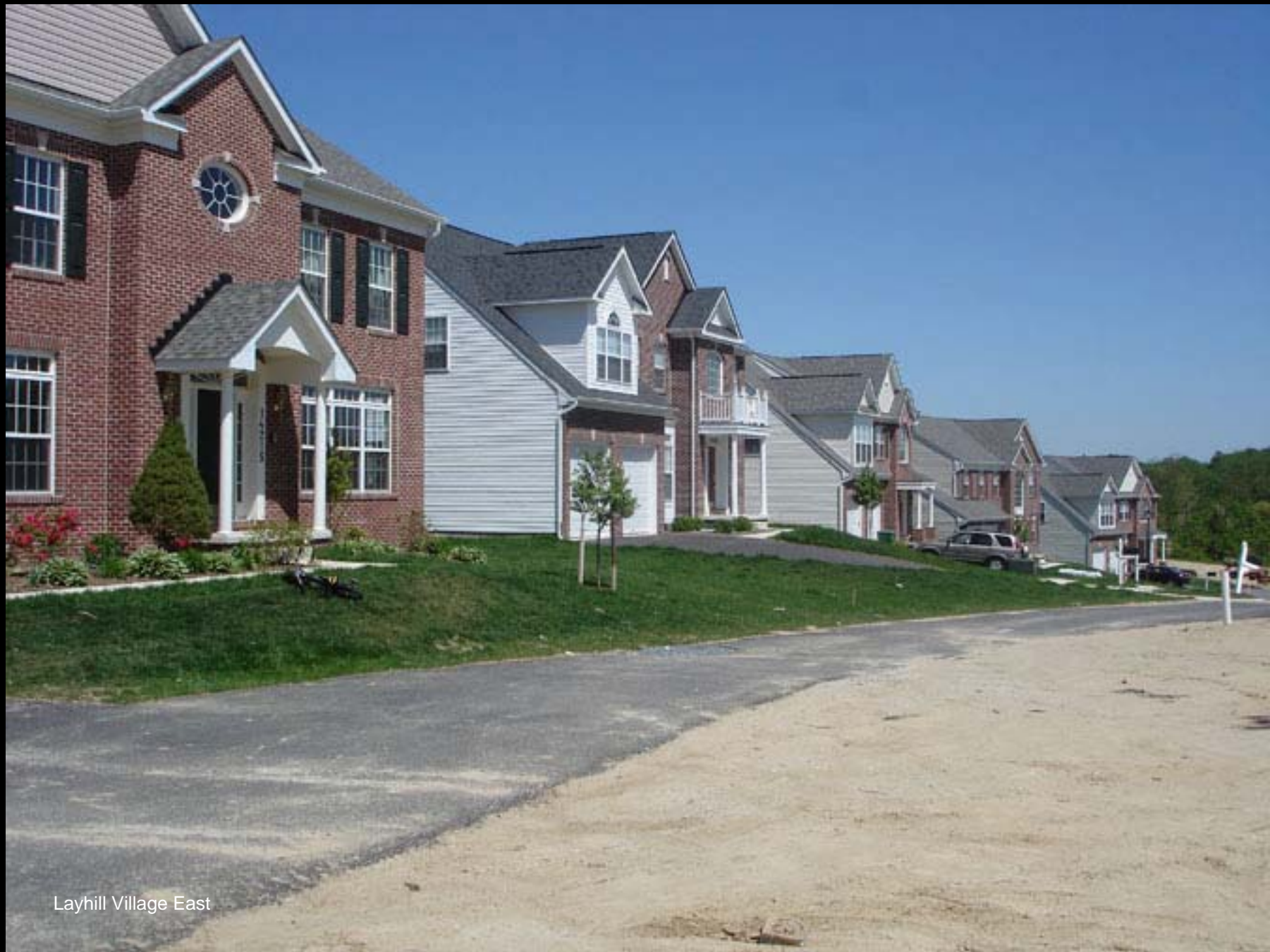
Layhill Village East