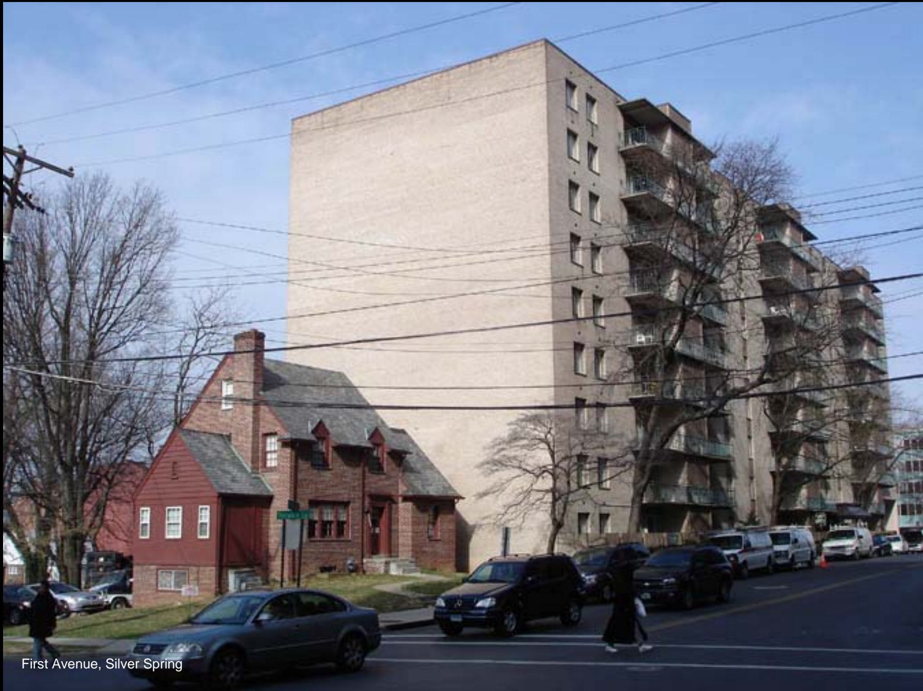
First Avenue, Silver Spring