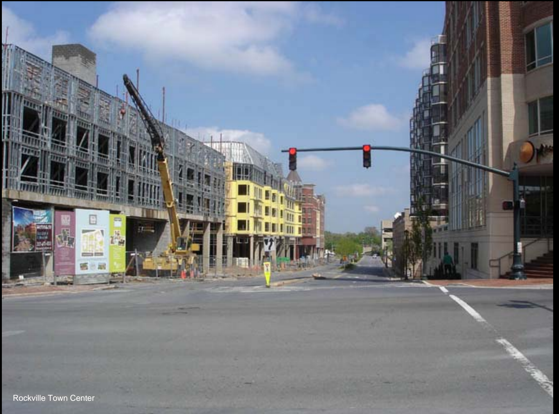
Rockville Town Center