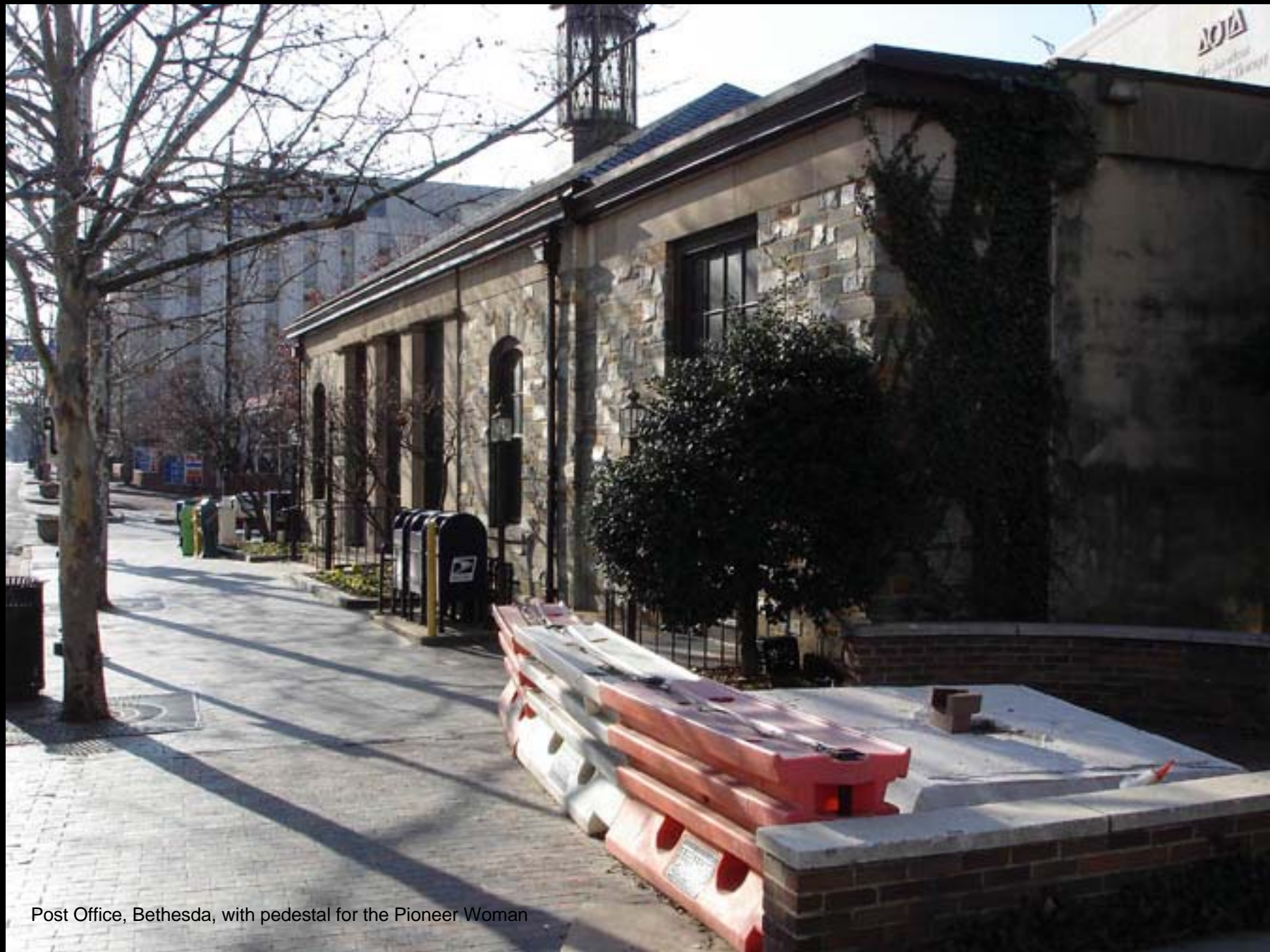
Post Office, Bethesda, with pedestal for the Pioneer Woman