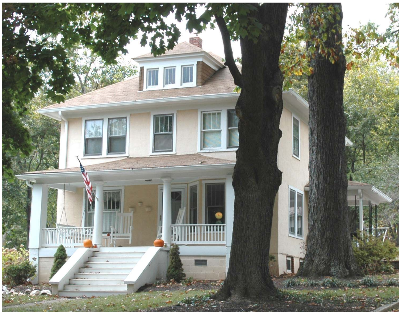
Ottie & Tressie Moxley House, 28411 Kempton Road South (front) façade, 11-2007