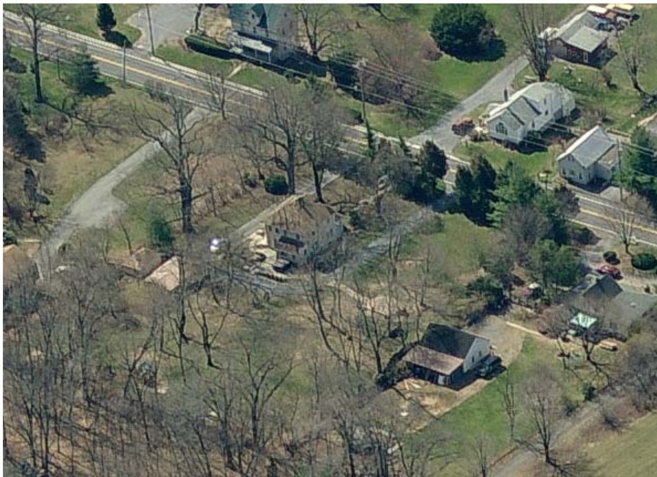
Ottie & Tressie Moxley House, 28411 Kemptown Road Aerial view showing rear facade