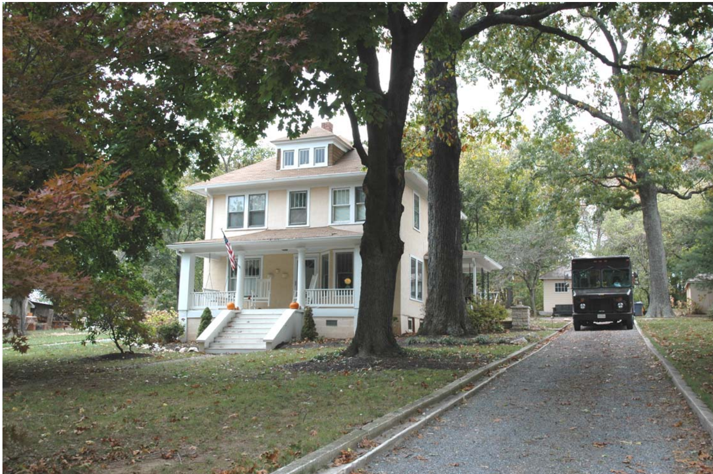
Ottie & Tressie Moxley House, 28411 Kempton Road View from Kempton Road, looking north, 11-2007