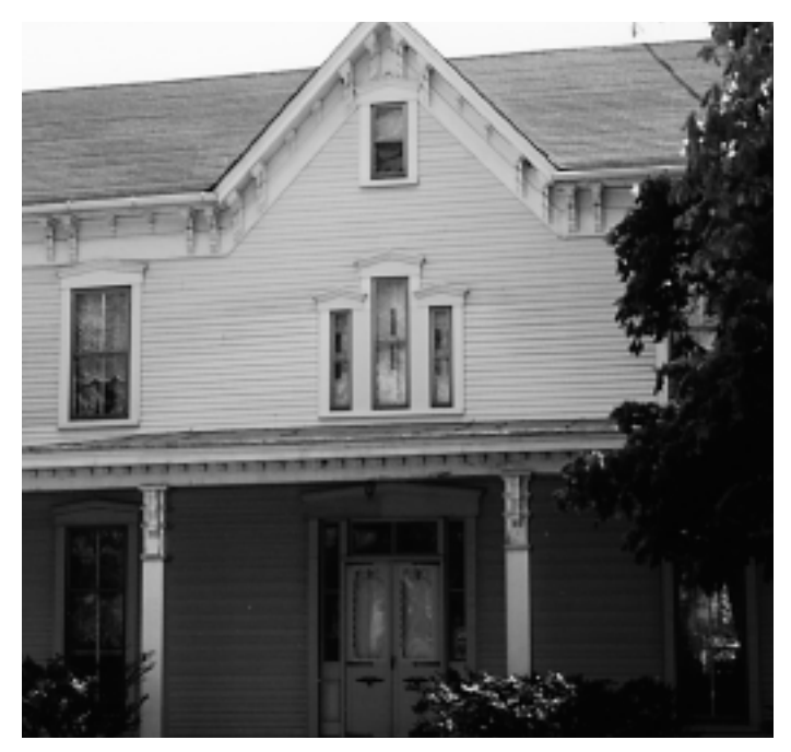
Second-story Palladian window

Palladian window—A window with a central arched section flanked by narrow rectangular sections. Also known as a Venetian window, this window arrangement was popular in England in the early 1700s, and in the American colonies from the 1760s. The earliest Palladian-