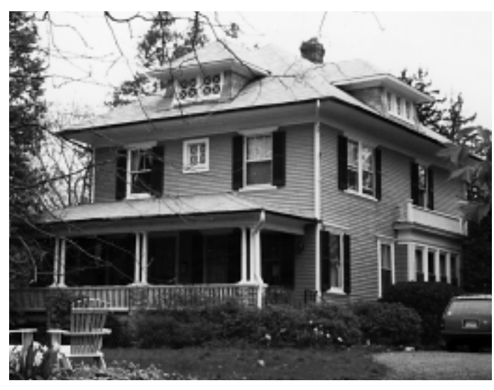
Simpson Family House (c1905)—a Colonial Revival-style Four Square house.

Four Square-A building form popular in the late 1800s and early 1900s, characterized by a two-story, hip-roofed, cubical mass, with typically four rooms on each level. Builders constructed Four Square houses in a variety of architectural styles, including Colonial Revival and Craftsman.