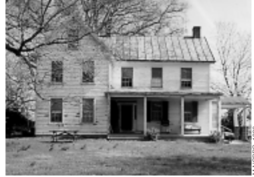
Oak Hill (c1865)