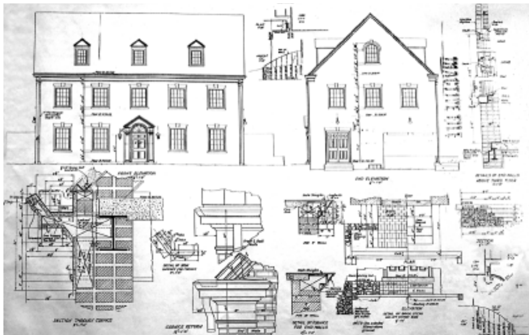
Robert B. Morse Water Filtration Complex (1929-36) 33/22