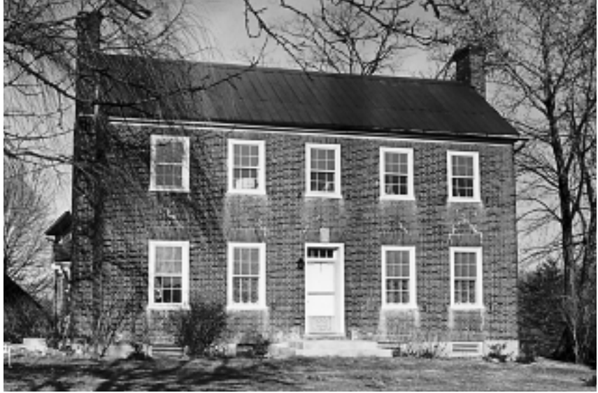
Maiden's Fancy (1807) 15/67

Maiden's Fancy is a remarkably well-preserved Federal style brick dwelling with external chimneys. James Ray and Lucretia Waters Ray built the distinguished residence in 1807. In contrast to the typical two-room log structures of this era, Maiden's Fancy was considered a mansion. The symmetrical five bay structure has Flemish bond masonry on the main façade and gauged flat arch window lintels. A keystone over the front door is incised with the date 1807. A contemporary rear addition replaces an earlier log wing. The property includes a stone smokehouse.