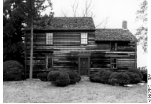
Waters Gift (c1750; East wing c1800) 15/65

John Waters, patriarch of a prominent local family and early settler in the region, built the original house at Waters Gift in c1750. The structure was a single-room chestnut log cabin with an exterior fieldstone chimney with soapstone fireplace. The east wing (right) was probably built about 1800. A newspaper advertisement in 1897 described the property with a frame dwelling house, corncrib, stable, tenant house, peach trees and a fine variety of cherry trees. The house was sheathed in redwood siding in 1972 when a rear shed addition was built.