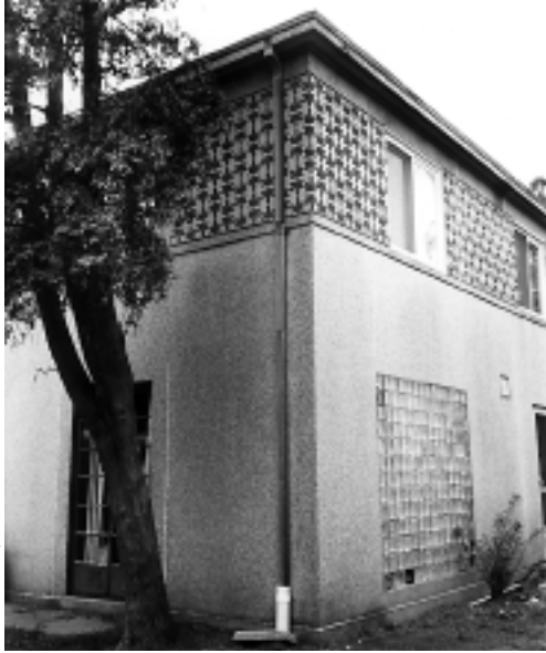
Constance Terry, MHCPPC, 1993

The Polychrome houses are located on contiguous lots with adjoining back yards in a middle class suburban neighborhood in Silver Spring. Polychrome I was the prototype house, designed in collaboration with Washington architect J. R. Kennedy, and completed in 1934. Located on Colesville Road, Polychrome I (shown below) is a one-story dwelling, with a detached garage. Its immediate neighbor Polychrome II, is also one story yet has an attached garage. The houses on Sutherland Road are two stories tall with attached carports.