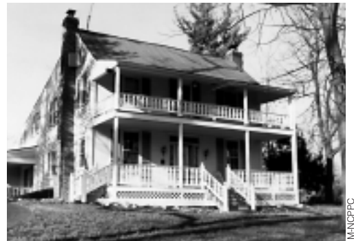
Holly View (By 1783; Early to Mid 1800s)

By 1783, Josiah Beane had built a 16' x 12' log house on this property. The overall form of the present structure, with extended roofline and two-story gallery porch, is similar to some of the County's earliest dwellings, including No Gain of Chevy Chase and the Holland Houses of Brookeville. The construction of this main block, however, may date as late as the 1850s, when proprietor of Burnt Mills, James L. Bond, owned the property. Comptroller of the U.S. Currency, James Meline purchased Holly View in 1881. Colonel Oliver Kinsman, a prominent Civil War veteran, purchased the property in 1886. It remained in his family's ownership for over 100 years.