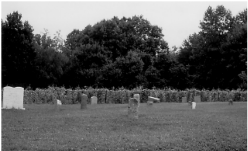
Burton Family Cemetery 15/76 (c1832-1870s)