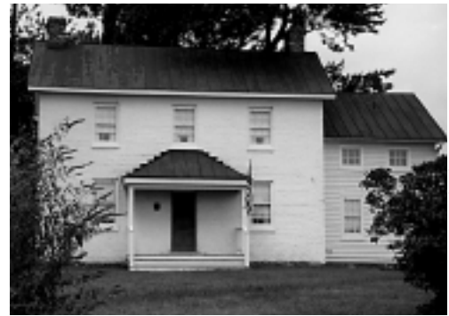
O'Hare House (c1825) 28/33

The O'Hare House is a well-preserved example of a brick folk house built c1825. One-room deep with a center passage plan, the modest dwelling has common bond brickwork, reflecting traditional building practices. Samuel Shreve, who likely built the house, resided in the dwelling until his death in 1861. The property was described in 1865 as containing a "very comfortable dwelling and all other necessary outbuildings, is well fenced, well watered, and about half of it is very heavily timbered with oak, hickory, and chestnut, and has a great variety of fruit trees on it." Shreve's daughter Ann and husband Christopher O'Hare and their descendants owned the farm until 1905. The property includes a brick smokehouse and a sizeable root cellar with a brick vaulted roof. The side wing of sympathetic design dates from 1986.