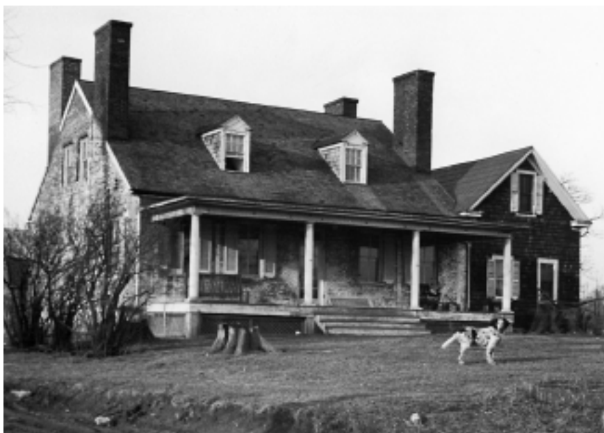
George Beall Collection, 1930s; M-NCPPC

A distinguished 1½-story Georgian style residence, Rolling Ridge is a fine and uncommon local example of Chesapeake English building traditions with its broad sloping roof, paired end chimneys and double pile plan. Classical brick pilasters between the outer bays and at the corners accentuate the symmetry of the five bay façade. The symmetrical exterior is reflected on the interior by a central passage and four equal size rooms. Robert Ober, a prosperous Georgetown merchant of English descent, built Rolling Ridge.