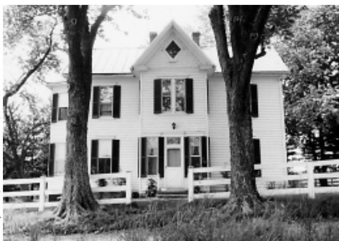
Kimberly Prothro, Traceries, for M-NCPPC, 1990

One of the grandest hotels built in the Boyds area, High View is representative of the post-railroad summer resort era in the Ten Mile Creek Valley. After the opening of the Metropolitan Branch of the B & O Railroad, several hotels operated in the area, serving Washingtonians fleeing the city heat. High View is noteworthy as a building designed and built as a hotel. Other local property owners added rooms onto their houses to accommodate boarders. Somerset T. Williams built this grand 22-room hotel in 1887, naming it High View in honor of its setting on a knoll overlooking Ten Mile Creek Valley. Located in the community of Burdette, just outside Boyds, Williams' inn was also known as the Burdette Hotel. The substantial Second Empire style structure has a mansard roof with patterned slate. The front façade has a polygonal projecting pavilion flanked by one-story porches, while two-story galleried porches open off the back of the house.