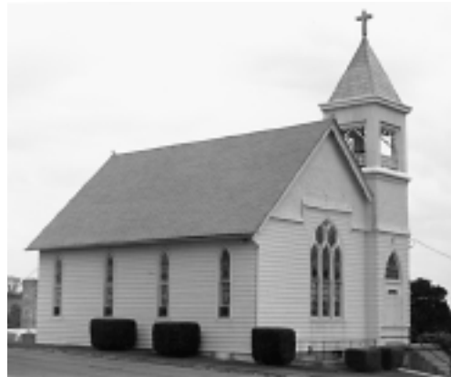
Salem Methodist Episcopal Church 14/26 (1907)

The Salem Methodist Church is architecturally noteworthy as a late, rural example of a Gothic Revival frame church. A three-story entrance tower, dominating the front gable structure, has an open, bracketed belfry on the top level. The front façade of the main block has a pointed-arch stained-glass tracery window. The name Salem M.E. Church is inscribed in a stained-glass transom and in a northwest cornerstone, which also includes the construction date. The second-level of the tower and main block is enlivened with patterned shingles. A four-bay side wing is a social hall built in 1937. A church basement was excavated in 1954 for classrooms and aluminum siding was added to the lower level of the church in the 1960s. With the unification of the Methodist Church, the church's name was changed in 1969 to Salem United Methodist Church. The first Salem Church was a log structure built about 1869 near the present structure.