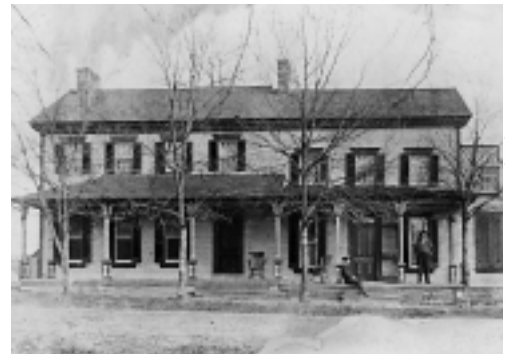
Hyatt House 10/59 (early 1800s & additions) Historic view

Many of the post-Civil War residences have cross gable roofs, bracketed cornices, or bargeboard (gingerbread trim). One-story additions that served as doctor's offices or post offices are reminders of the commercial uses that supplemented the residential nature of the buildings. In the late 20 th century years, many of the old homes were abandoned due to polluted water. After a new sewage treatment plant opened in 1998, residents are restoring houses and Hyattstown is once again becoming a vital community.