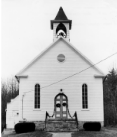
Hyattstown Christian Church (1871) 10/59

Many of the houses in Hyattstown include log sections that are covered with siding. The earlier houses, from the early and mid 1800s, are three-bay dwellings with little ornamentation. The Davis House (c1810-15), 26020 Frederick Road, is an uncommon example of a brick Federal-style dwelling in the north-