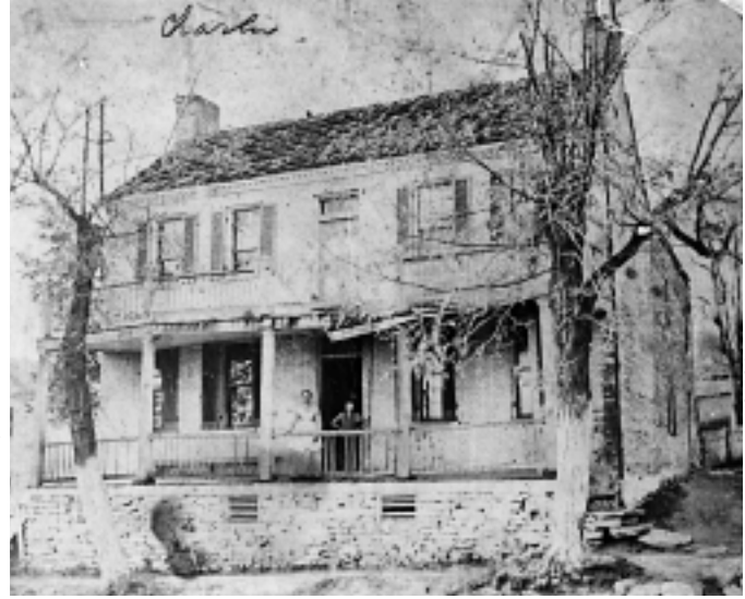
Davis House (c1810-15); 10/59-1 photo late 1800s