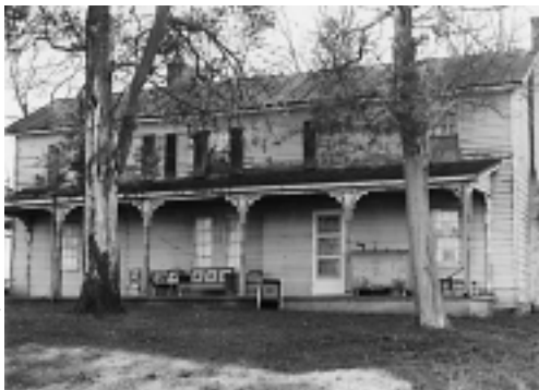
Michael Dwyer, M-NCPPC, 1974

The Etchison family, widespread in this part of the county, gave their name to a nearby crossroads community. The Perry Etchison House represents an upper Montgomery County farm from the mid-1800s. The dwelling has three sections. Two 1½-story, three-bay log structures stand at the center and west end. Between these two sections stands a large chimney with stone base and brick stack. In plan, each section is a single room with a staircase on the wall opposite the fireplace. The two-story Federal style east section is frame and has a three-bay façade with side entrance. West of the house is a barn constructed of two large corncribs flanking a thrashing floor. Behind the house are a log corncrib and a log smokehouse. The dilapidated buildings are in danger of demolition by neglect.