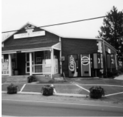
Clarksburg School (1909)

Growth in Clarksburg declined in the late 19 th century, when the B & O Railroad bypassed the town for nearby Boyds. The advent of the automobile and improved roads brought something of an economic revival beginning in the 1920s. New boarding houses opened in town to accommodate the new auto tourism.