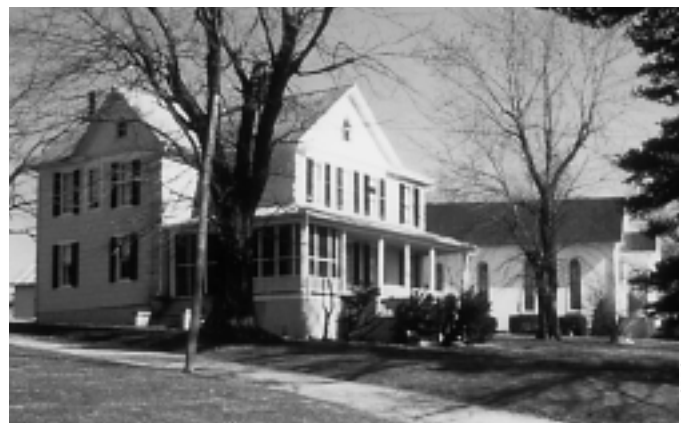
Cedar Grove streetscape 14/27

Cedar Grove is a crossroads community that grew around a small commercial core. In 1851, Oliver T. Watkins acquired 200 acres, well located on Little Seneca Creek, and, by 1865, constructed a frame house on a knoll, 23400 Ridge Road. This Oliver Watkins Farm , located in the Ovid Hazen Wells Park is an individual historic site (see separate description). When the Metropolitan Branch of the B & O Railroad opened in 1873, Ridge Road became a well-traveled route to the Germantown station. In this era, Watkins opened a general store. An 1879 promotion advertised "Cedar Grove, Oliver T. Watkins, Dealer in General M[erchandi]se., Country Produce taken in Exchange for Goods — Dry Goods, Boots, Shoes, Liquors, etc." The Cedar Grove General Store , 23412 Ridge Road, built in 1909, is the successor to the original store and is built on the same site. The store is a two-story, front-