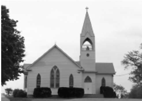
Greenthorne &amp; O'Mara, for M-NCPPC, 1990

As a major stagecoach stop between Frederick and Georgetown, Clarksburg supported several inns and taverns. By the mid-1800s, the town also included general stores, a tannery and blacksmiths, and wheel-