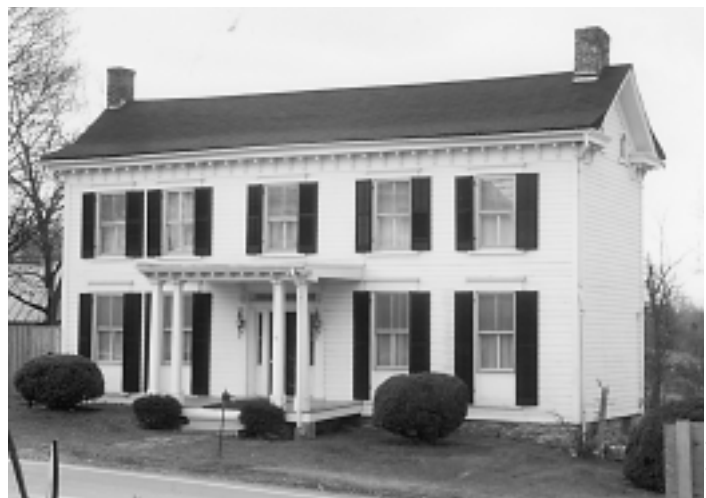
Clark-Waters House (1797; 1840s)