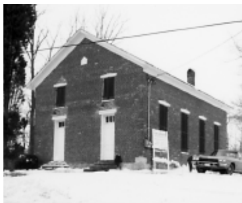
Sugar Loaf Mountain Chapel (1861) 10/70

Sugar Loaf Mountain Chapel was the work of William T. Hilton, a skillful master builder who built many notable buildings in the Dickerson area. The building is an early brick example of a conscious attempt at style for a rural church. Greek Revival design influence is seen in the wide cornice, pedimented or shaped lintels, and front-gable orientation. Materials were obtained locally: wood cut nearby; bricks molded and fired on the adjacent Davis property; and slate roof shingles quarried in Little Bennett