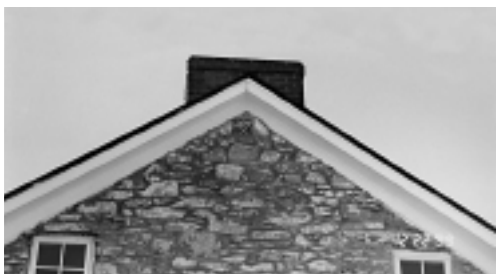
Frederick Gaither House