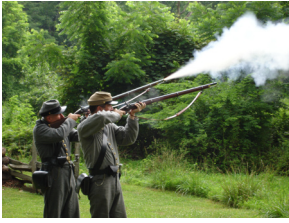
Civil War reenactors will perform in this year's Montgomery County Heritage Days celebration.