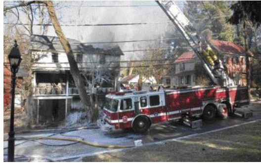
Fire from an unattended wood stove resulted in the total loss of this historic home in Brookeville.

Earlier in the year, on February 6, a historic home in Brookeville, built in the first quarter of the 19th century, was a total loss to a fire started by an unattended wood stove.