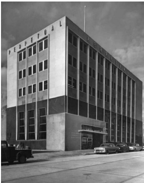
The Perpetual Building Association Building (above) and Falkland Apartments, both in downtown Silver Spring, are being considered for County historic designation.