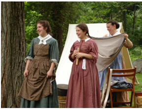
Wilcox family reenactors.