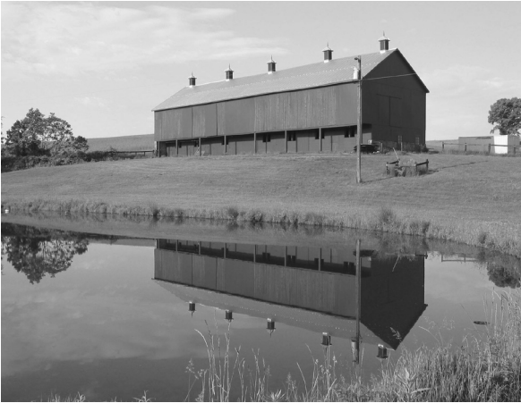
White-Carlin Barn in Boyds is featured in the Barns of Montgomery County notecards.