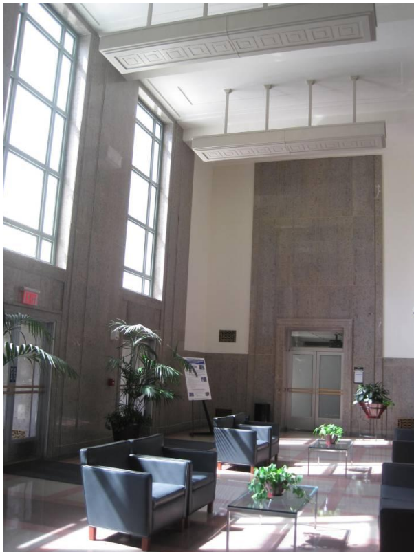
Main lobby and front entrance windows, 2011