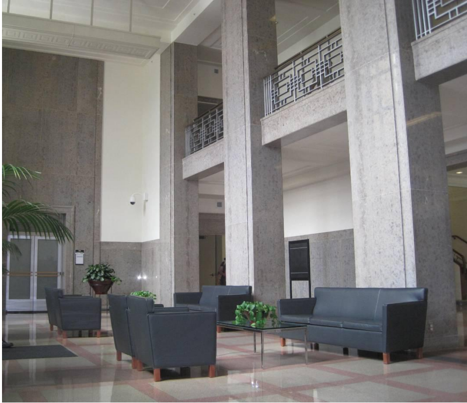
Main lobby, 2011