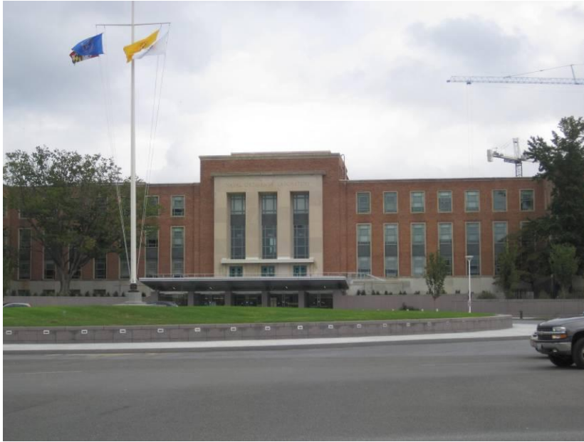
Front façade, partial view, with flagpole and partially submerged new entry, 2011