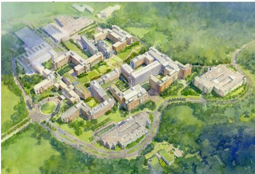
Federal Drug Administration Consolidated Headquarters White Oak Campus Plan, with Administration Building on left at terminus of traffic circle