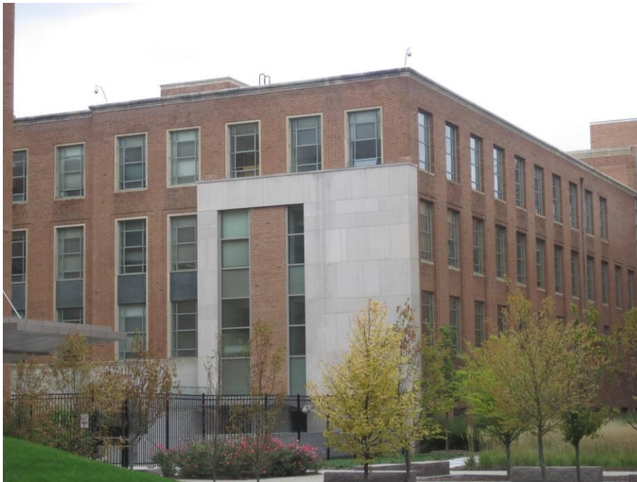
Southeast façade with limestone panels where connector wing once stood, 2011