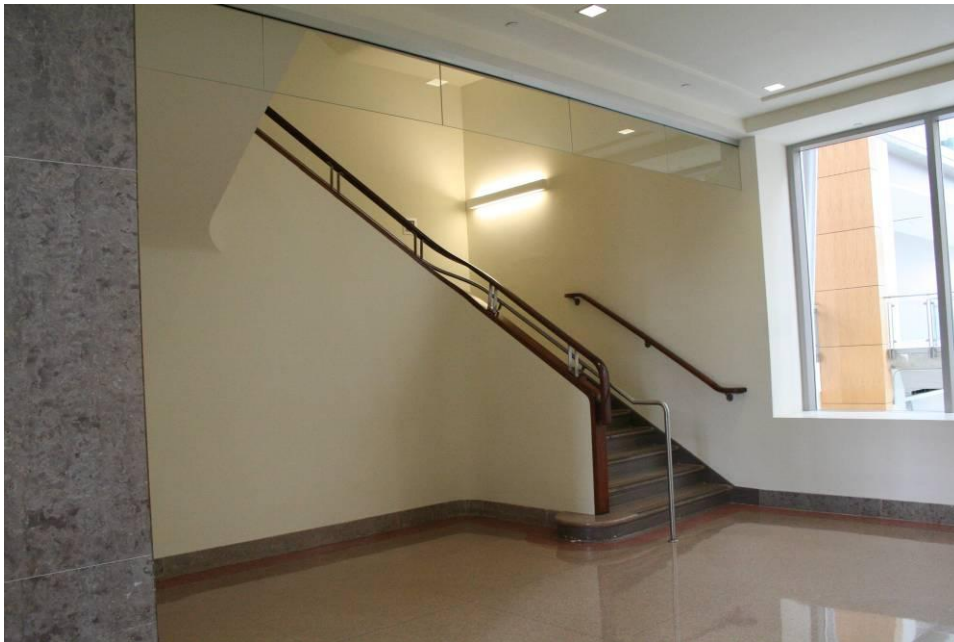
Stairwell with added railing (for code purposes), rear public stairwell lobby, 2011