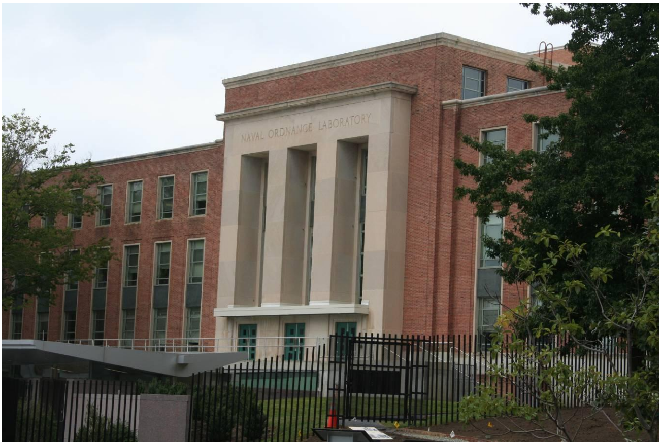
Front (southwest) façade, tripartite central entry, inscribed with words "Naval Ordnance Laboratory", 2011