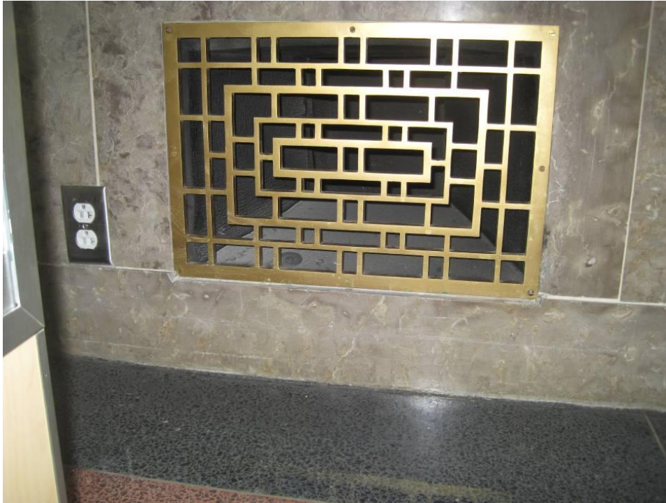
Brass fretwork in main lobby, 2011