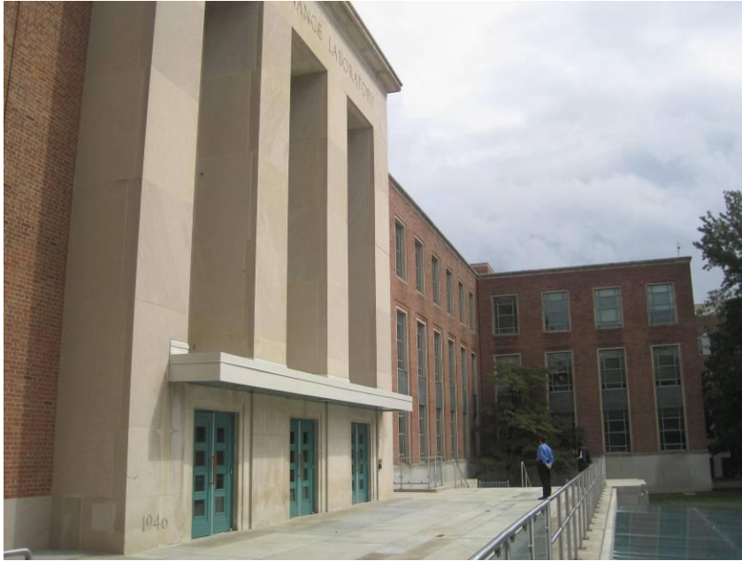
Looking toward northwest façade of southeastern ell, 2011