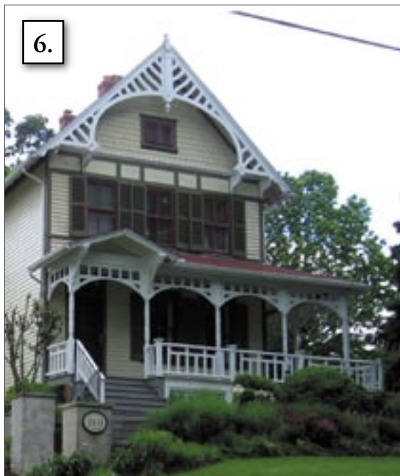
Guideline 1.1: The wrap around front porch, uniquely designed balustrade, post brackets, and ornate barge board are all character-defining features of this structure that should be preserved.

Design guidelines are further explained with photographs and illustrations. The examples given should not be considered the only appropriate options, however. Each illustration is accompanied by a caption.