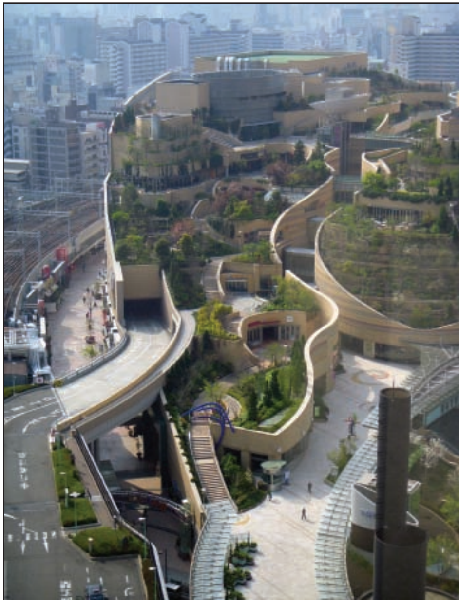
Namba Parks (Osaka, Japan) is an extraordinary example of nature in a retail environment. It is a 120 tenant shopping mall containing offices, shops, and restaurants. The eight-level complex is draped with terraced rooftop forests and gardens.

Trees are a living resource and change in character and form over time, providing many opportunities for positive shopper experiences. Here are design guidelines for integrating trees into the retail streetscape.