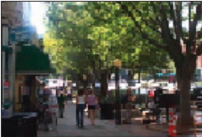
HIGH Green Streets Mean 4.00 (sd 0.60)