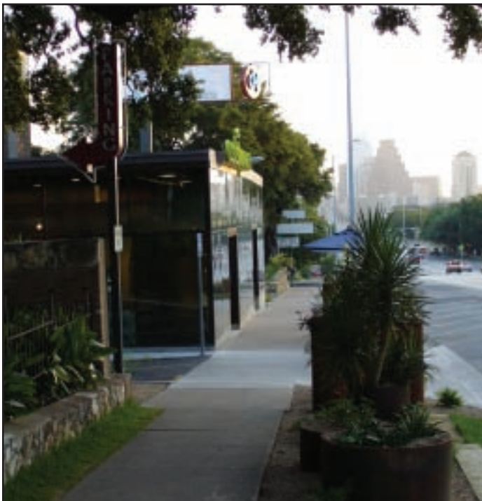
Place design using trees, planters, and accessory vegetation.