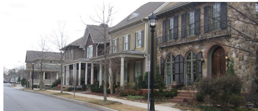
GARAGE PLACEMENT PLAYS AN IMPORTANT ROLE IN ESTABLISHING THE WALKABILITY OF A STREET. THE TOP IMAGE (EPA SMART GROWTH) IS OVER DOMINATED BY STREET-FACING GARAGES. THE BOTTOM IMAGE (GLENWOOD PARK IN ATLANTA) HAS ALLEY- OR REAR-LOADED GARAGES.