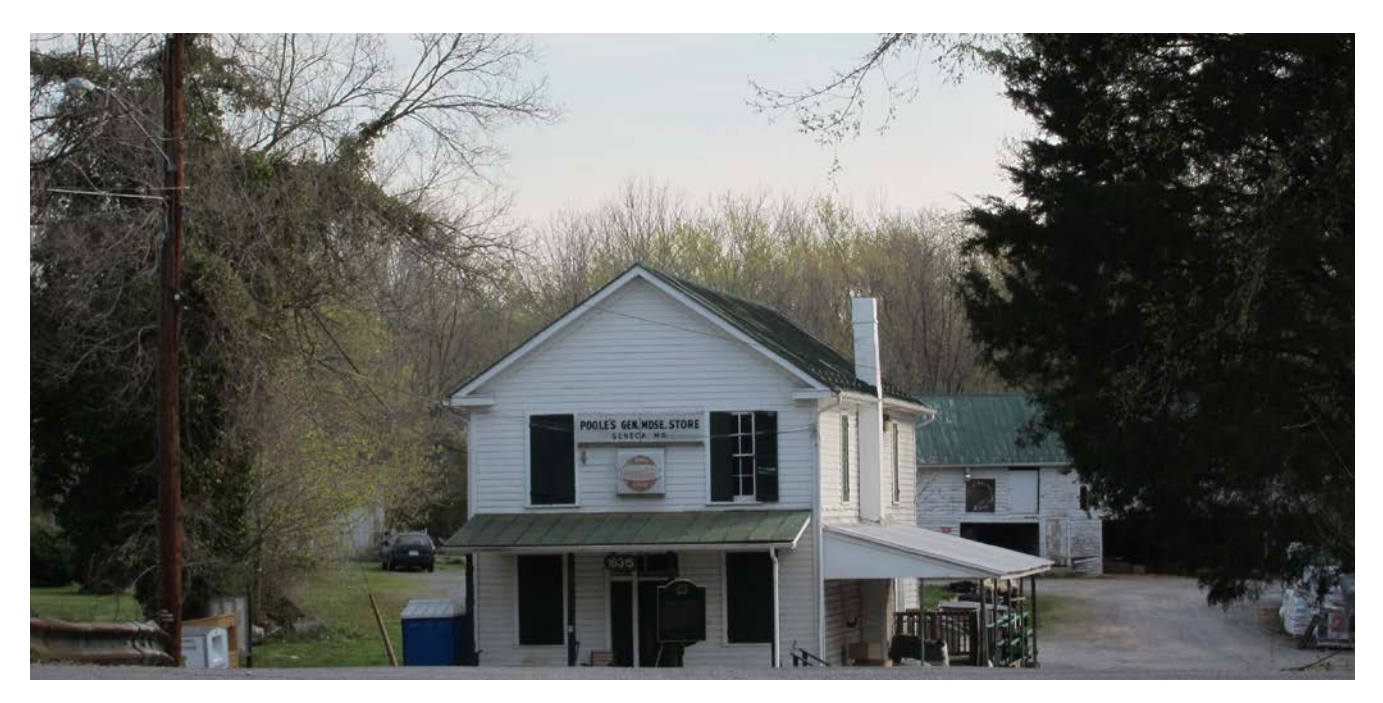
Seneca Store (Pooles Store) is located on the original alignment of River Road, which is now called Old River Road, a rustic road.