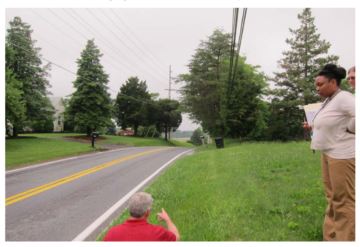
A group meets on Mountain View Road, a rustic road, to work with the applicant on a safe and compatible driveway location for a new church in historic Purdum.

Dewa Sahili, also from MCDOT, presented a proposal for improvements to the end of Stringtown Road, a rustic road, to assure a safe connecting alignment with Snowden Farm Parkway.