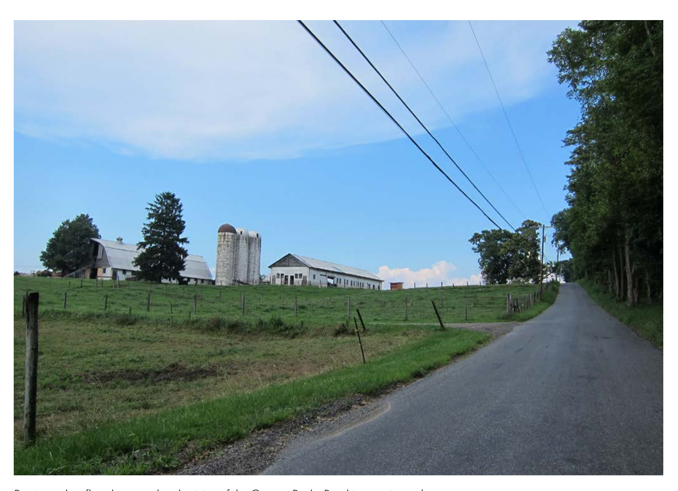
Rustic roads reflect the agricultural origins of the County. Rocky Road is a rustic road.