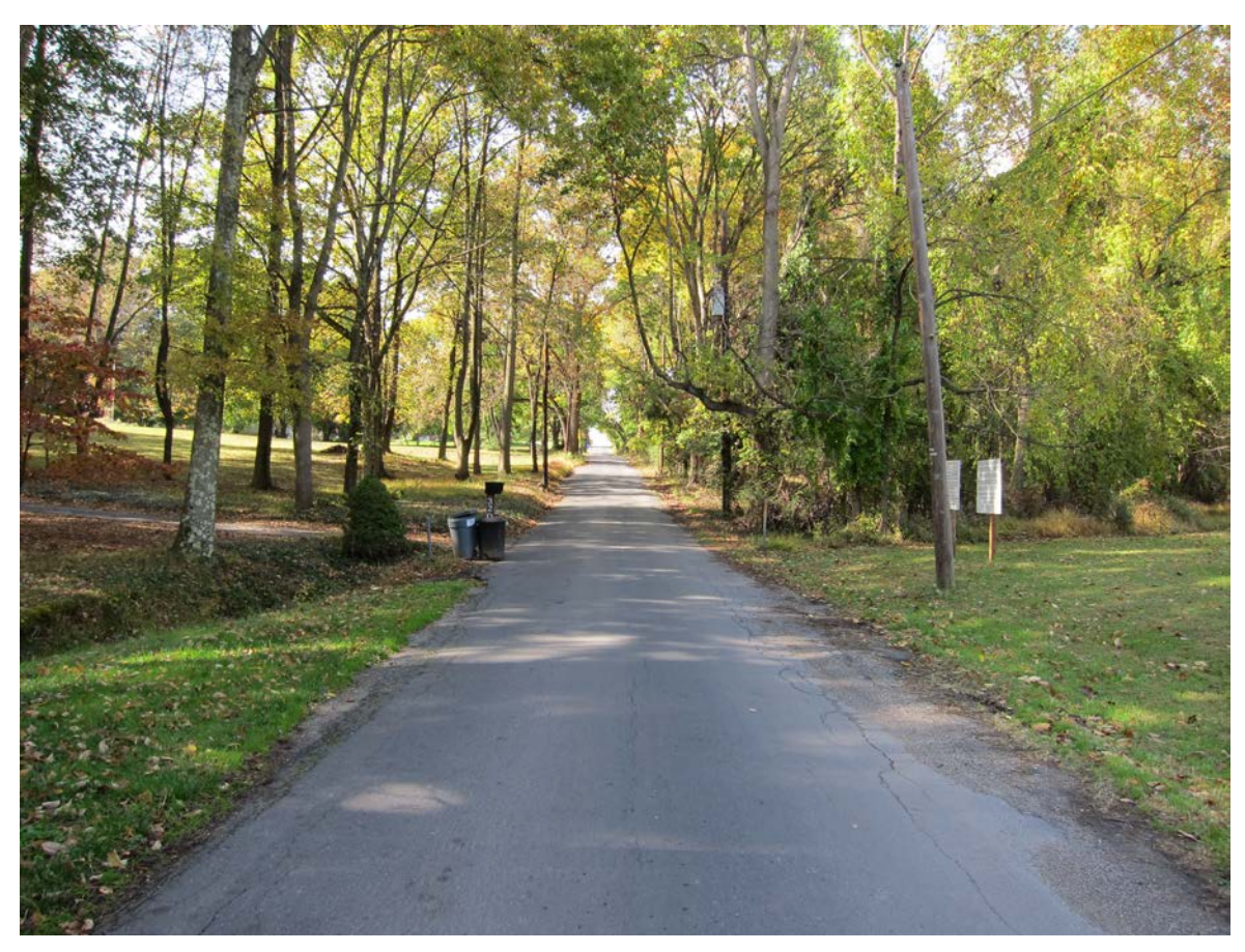
RRAC members support the assessment of Emory Church Road for addition to the Rustic Roads Program.al origins of the County. Rocky Road is a rustic road.

The most significant effort to increase education and public awareness of the Rustic Roads Program since the last reporting period has been the completion of a draft of the Rustic Roads guidelines, now named the Rustic Roads Advisory Committee Resource Manual. This manual has been circulated to the community, various agencies and committees in order to obtain comments; those comments have been compiled and reviewed, and the re-write of the document is nearing completion at this time. The committee anticipates recirculating the manual at the end of summer 2014, allowing for one final round of comments before the document is published in 2015.