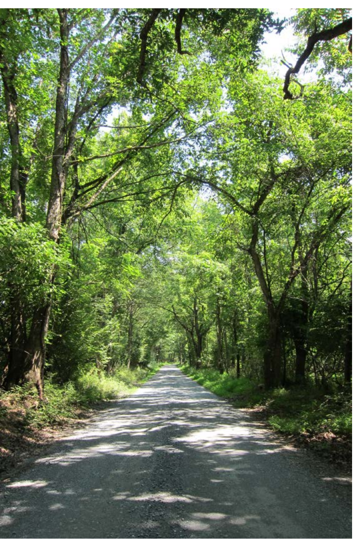
River Road is believed to follow a trail established by Native Americans. The unpaved section in Poolesville between Edwards Ferry Road and Whites Ferry is an exceptional rustic road.

Following the enthusiastic reception of the brown, Adopt A Rustic Road signs, the RRAC requested that rustic and exceptional rustic roads be identified with similar brown street name signs. This proposal was approved by MCDOT staff who indicated that the current green signs would be replaced by brown signs on the regular replacement cycle. Until then, requests have been made to have the signs on Stringtown Road and Batchellors Forest Road changed, as projects on those