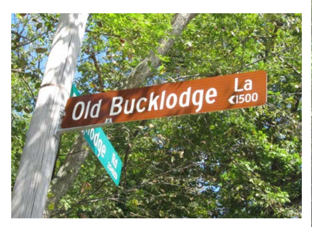
The RRAC and MCDOT worked together in 2012 to develop a brown, street name sign for rustic roads.

Former RRAC member Robert Goldberg worked with MCDOT to have warning signs posted in two locations where unique conditions exist: before the ford on West Old Baltimore Road, an exceptional rustic road, and before the one-lane bridge with a sharp bend on Huntmaster Road, adjacent to Davis Mill Road, a rustic road.