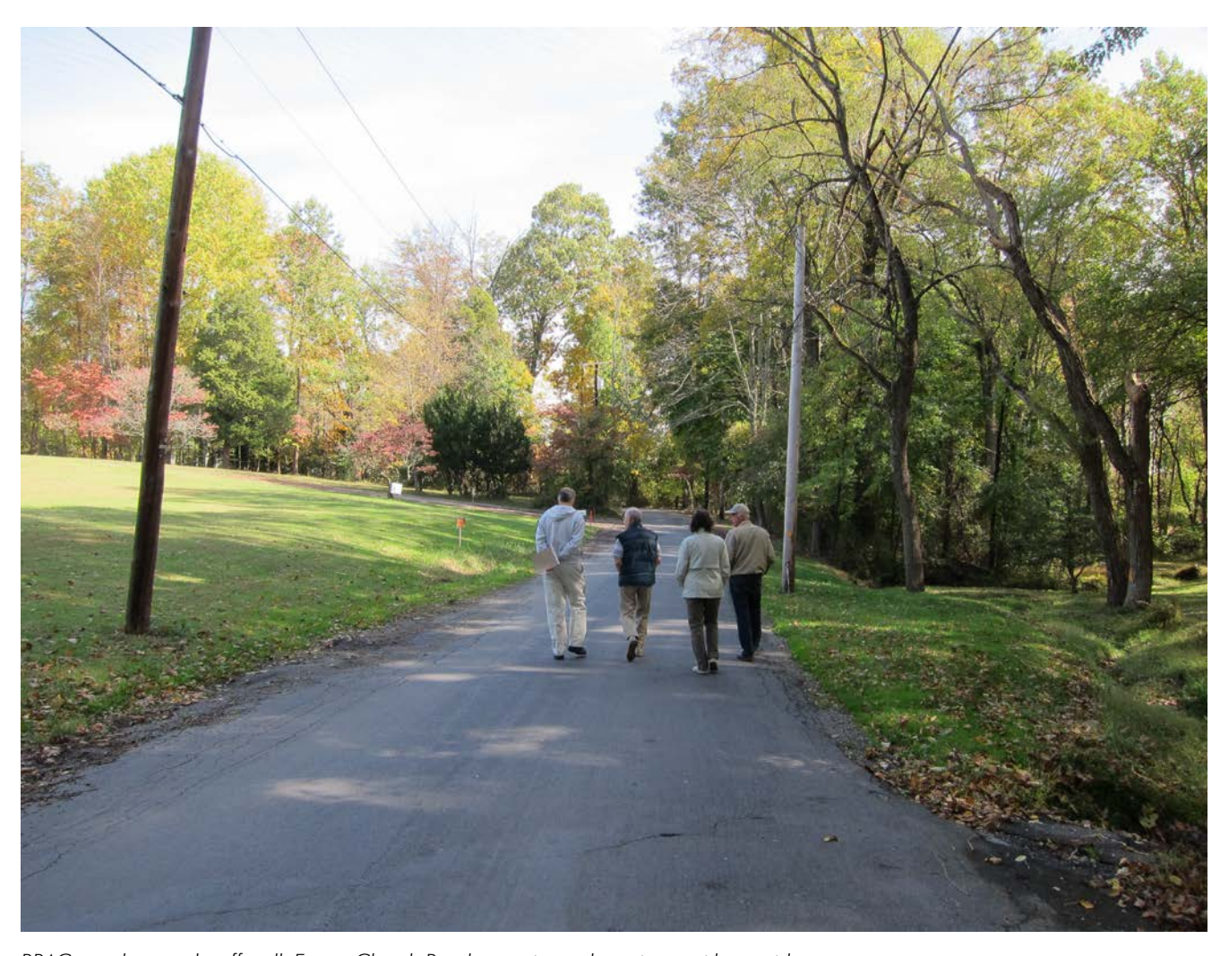
RRAC members and staff walk Emory Church Road, a rustic road nominee, with a resident.