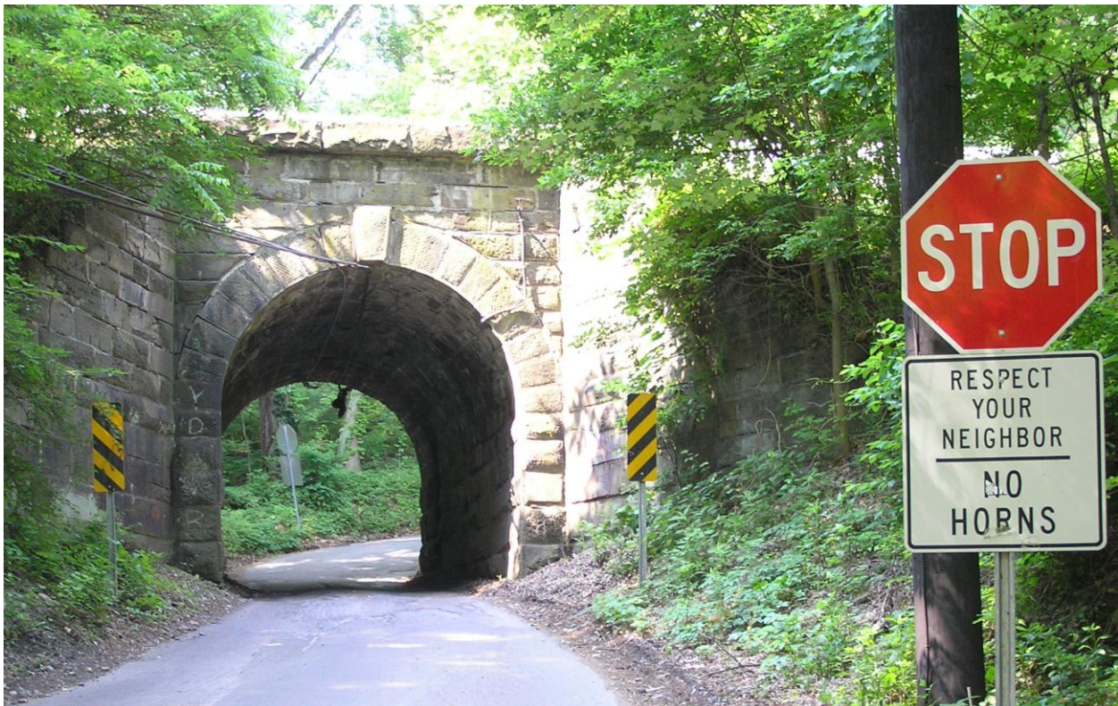
Game Preserve Road (rustic) is the most recent addition to the rustic roads program

The RRAC evaluated and recommended designation of Game Preserve Road between MD 355 and MD 177 as a Rustic Road as part of the Gaithersburg West Master Plan (Great Seneca Science Corridor). This recommendation was subsequently approved by the Department of Transportation (DOT), the Maryland-National Capital Park and Planning Commission (M-NCPPC) and the County Council.