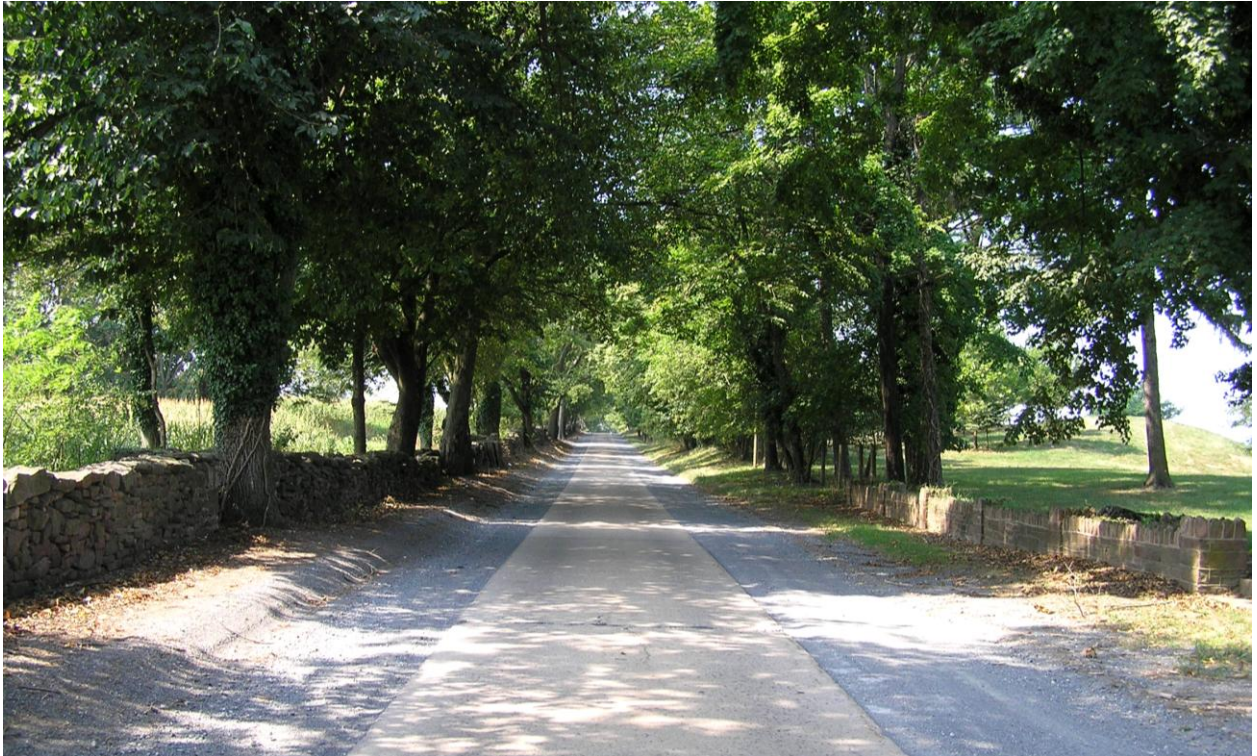
Martinsburg Road (exceptional rustic) is one of two concrete Politicians roads remaining in the County

In the previous biennial report, the RRAC recommended that a Capital Improvement Project (CIP) be created and funded to provide for the restoration of the concrete pavement on Martinsburg Road and Sugarland Road. Although this did not occur, the Committee continues to support such an effort. These roads require continual costly joint and shoulder maintenance. Additionally, the unstable shoulders together with the loss of skid resistance on the concrete pavement can be hazardous to the safety of roadway users.