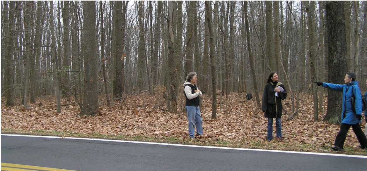
Reviewing potential new entrances along Peach Tree Road (rustic)

The committee reviewed numerous other proposals along rustic roads and provided staff with input which was included in memos to the Development Review Committee and the Planning Board.