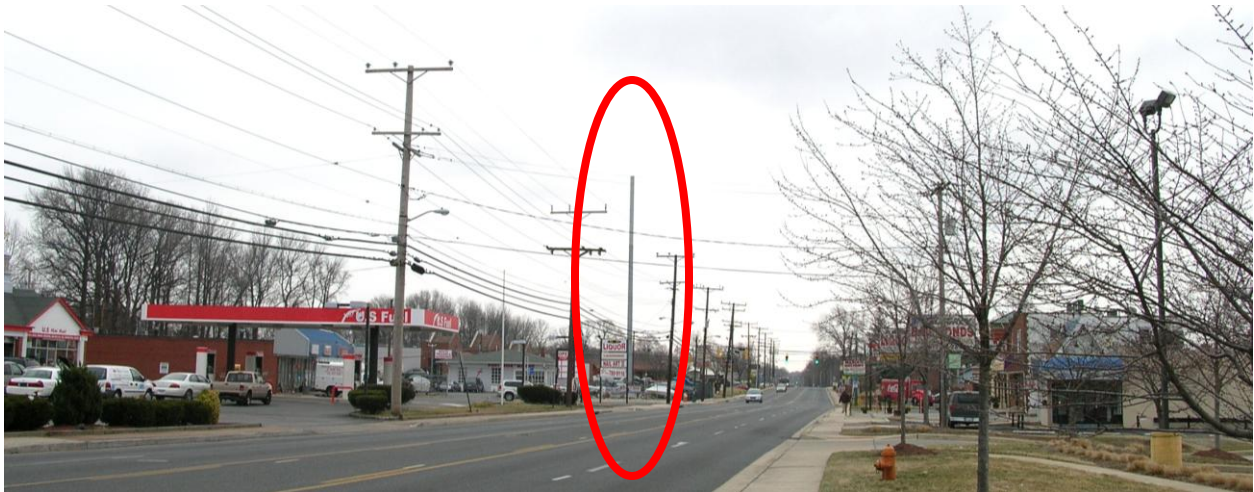
Cell towers with internal antennas such as those on this unipole in Baltimore County are more compatible with rustic roads.

The committee reviewed proposals for five T-Mobile cell towers (Wildcat Road, West Offutt Road, Wasche Road, Old Hundred Road and Mt. Ephraim Road). The general recommendation was that cell towers in the Agricultural Reserve on or within view of rustic roads should be set back from the road as far as possible, should be a monopole or slim pole design with internal antennae and an unobtrusive color, and should use existing driveways for access where possible.