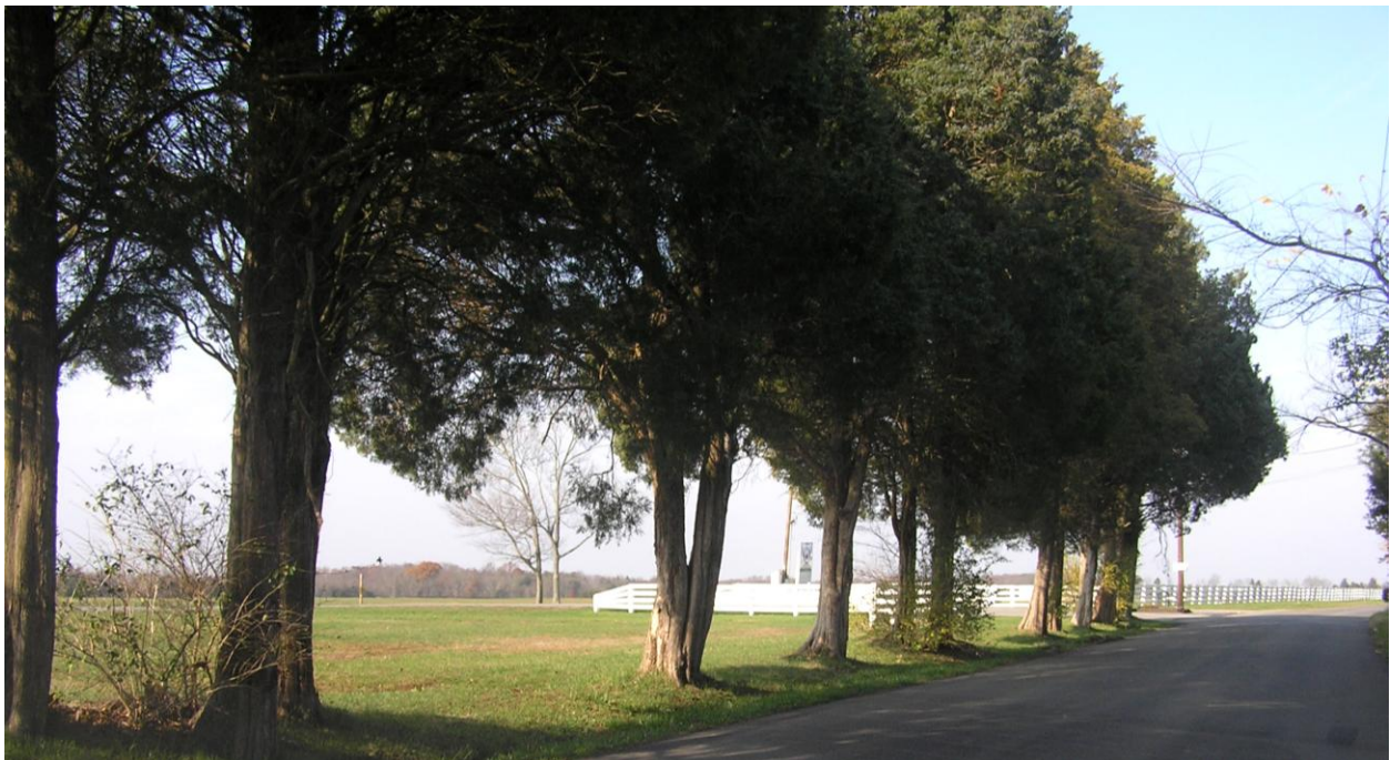
An example of a well-maintained hedgerow on Hughes Road (rustic)

The committee held a joint meeting in September 2008 with the Agricultural Advisory Committee (AAC) and the Agricultural Preservation Advisory Board (APAB) specifically to address the need for tree maintenance along rustic roads. This has become a major concern of farmers due to overgrowth that impacts their ability to operate farm machinery and safely traverse the roads. The Department of Transportation (DOT) tree maintenance representative indicated that there is currently no funding for cyclical maintenance, but rather tree trimming is complaint driven. The individual depots provide clearing and grubbing of brush along the roads and remove broken branches and fallen trees. The RRAC, the AAC and APAB subsequently sent a letter to the County Executive and County Council requesting additional funding for tree maintenance.