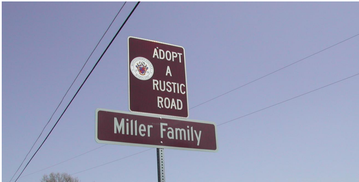
A new Adopt A Road sign on White Ground Road (exceptional rustic)

The RRAC is charged with promoting public awareness of the rustic roads program. Identification signs are not currently allowed on the roads. DOT is currently posting special brown Adopt A Road signs for rustic roads, and community feedback has been positive; more than 750 volunteers regularly clean road segments, including many on rustic roads. The RRAC would like to expand that effort to allow community organizations or developers to sponsor/fund identification signs. Allowing signs would require modification to the Executive Regulation. The RRAC recommends that this be done in coordination with the Design Guidelines.