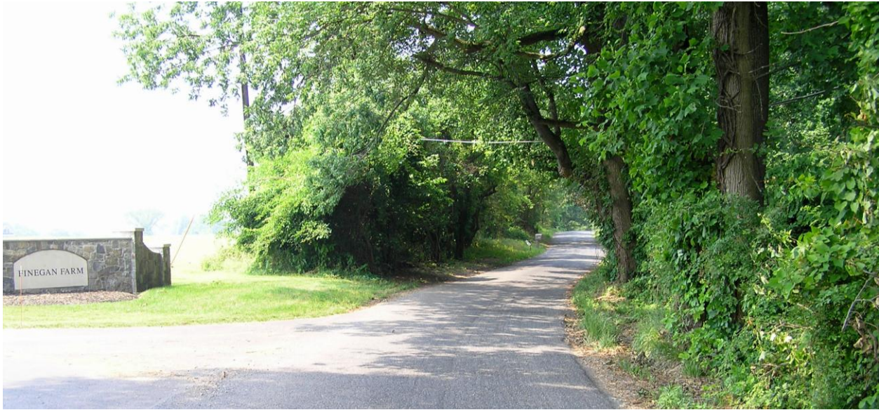
Entry sign on Berryville Road (exceptional rustic) that was built within the right of way