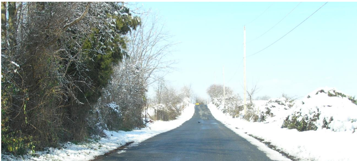
Rocky Road (rustic) after an early snow in December 2009

Development pressures in the Agricultural Reserve and in other areas where rustic roads are located, together with current budget constraints for maintenance, will be a continuing challenge for preservation of these vital and beautiful rural roads