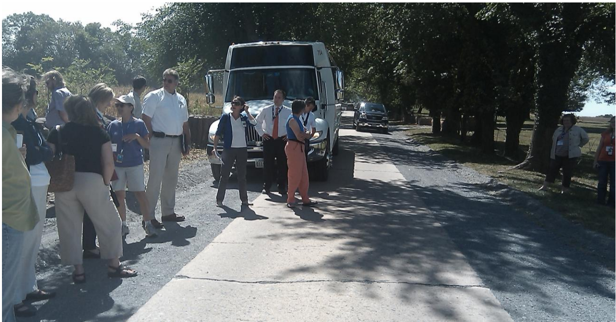
Tour participants discussed the history of Martinsburg Road (exceptional rustic) as well as maintenance and restoration issues

The Preserving the Historic Road Conference is a national event that was hosted in Washington D.C. in 2010. In recognition of the outstanding results of the Rustic Roads Program, representatives were invited to join the steering committee, and asked to host a tour of the roads. RRAC members and staff participated along with staff from the M-NCPPC, DOT, local historians and community members in an extensive tour of Montgomery County rustic roads (jointly with Loudoun County, Virginia) for conference participants. The tour contrasted Virginia's gravel road districts and Context Sensitive Solutions approach on rural and historic roads to the Rustic Roads Program In Montgomery County. The tour covered twelve rustic and exceptional rustic roads, bridges, a ford, an aqueduct, and a wide variety of features including historic road surfaces, roadside walls, historic and new bridges, and the maintenance of these unique roads. Invaluable assistance was provided by speakers on the tour including pavement management, construction and maintenance representatives from DOT, transportation, historic preservation, environmental and community planning representatives from the M-NCPPC, plus two historians and authors who live in the County and a former RRAC member who continues to be active in preserving the rustic roads.