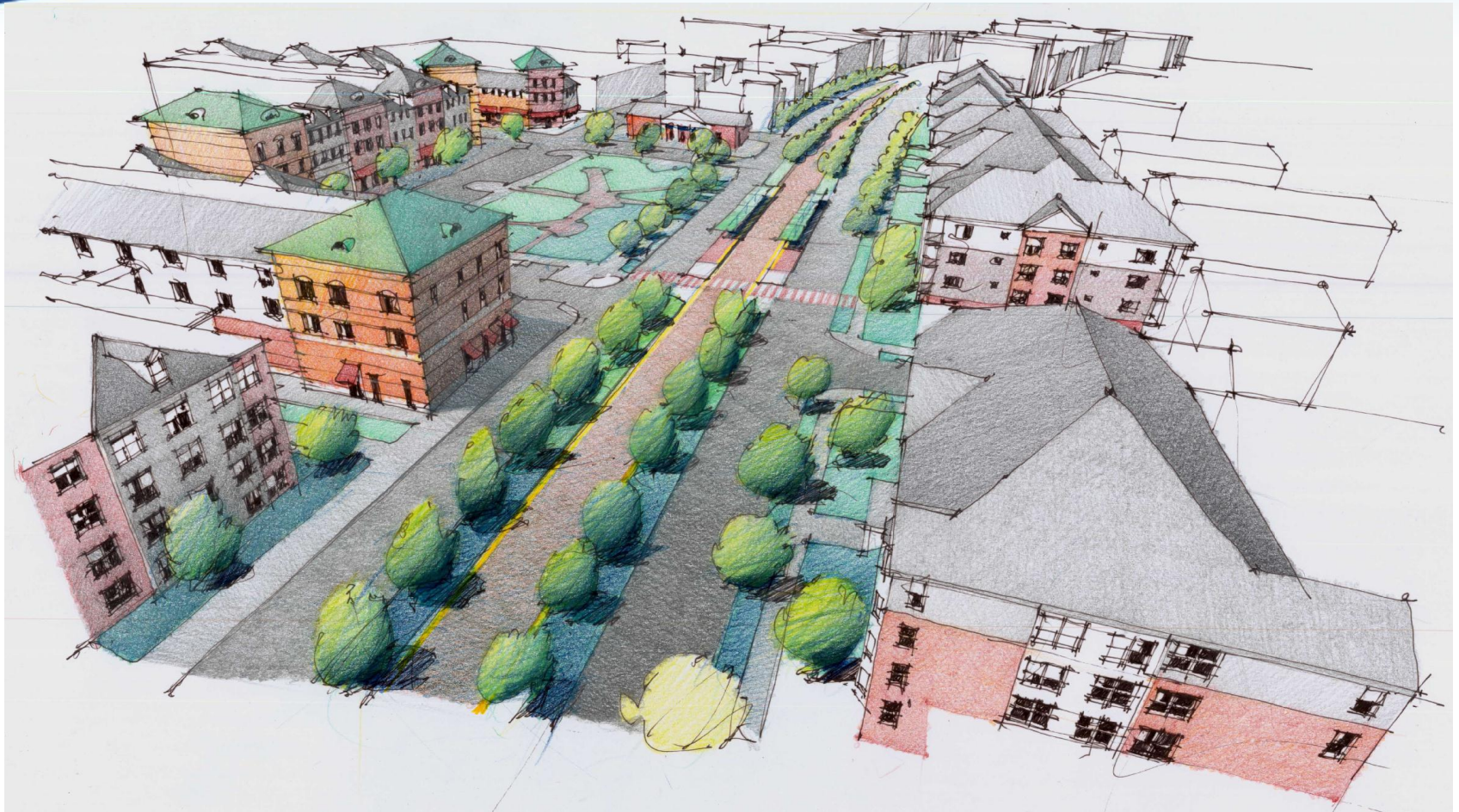
King Farm Station – Side Platform